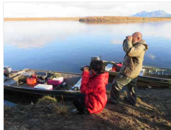
Patiently watching for caribou on the south bank of the Kobuk River at Onion Portage.