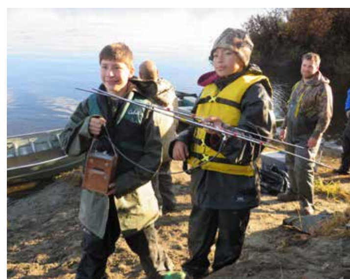
Students from Nome learn how caribou collar radiotracking equipment works.