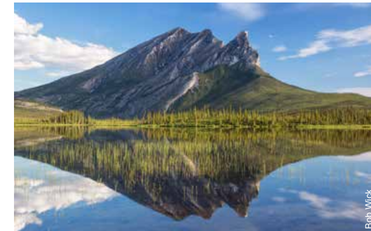
Sukakpak Mountain sparkles in this reflection from the north.

One of the most visually stunning ACECs is Sukakpak Mountain (MP 203 of the Dalton Highway). A massive wall of Skagit Limestone rising to 4,459 feet (1,338 meters) that glows in the afternoon sun, Sukakpak Mountain is an awe-inspiring sight. Peculiar ice-cored mounds known as palsas punctuate the ground at the mountain's base. "Sukakpak" is an Iñupiat Eskimo word meaning "marten deadfall." As pictured here from the north, the mountain resembles a carefully balanced log used to trap marten. The BLM designated this area in 1990 as an ACEC to protect extraordinary scenic and geologic formations.