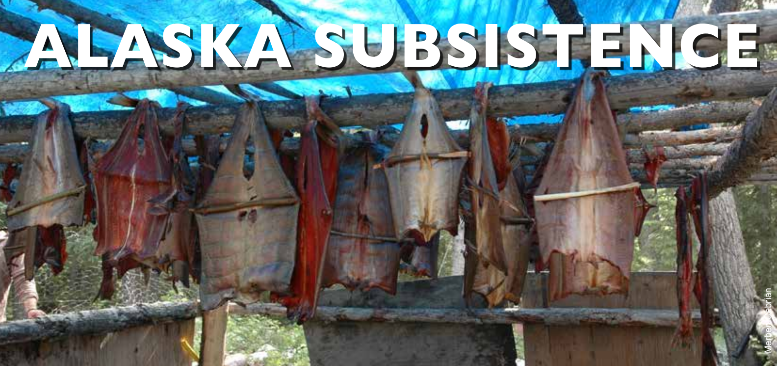
Preserving red salmon using the traditional drying method.