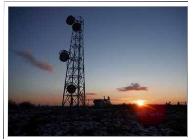
Grant Creek repeater site

and injection wells on a single well pad at GMT1, a gravel road for access, and will substantially reduce potential impacts of aircraft overflights local communities and subsistence users are concerned about. GMT1 would facilitate the first production and transportation by pipeline of oil from federal lands in the NPR-A. You can find out more at http://www.blm.gov/ak/GMTU1 .