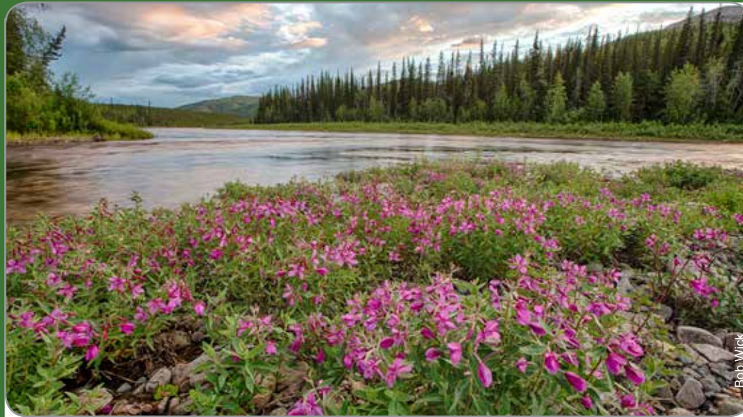
Beaver Creek Wild and Scenic River in White Mountains National Recreation Area.