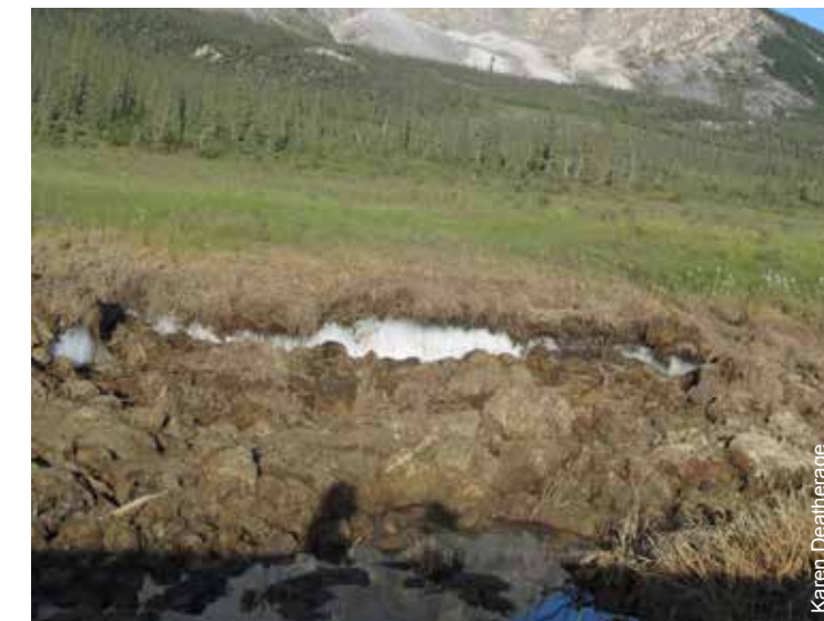
Palsas showing their ice cores at the base of Sukakpak Mountain.