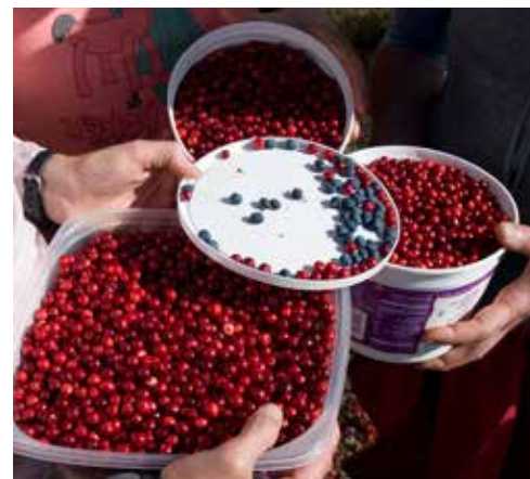
Harvesting berries like these cranberries, provides a good source of vitamin C to use through the long winter ahead.

A subsistence lifestyle means survival, perpetuating cultural or social ways of life, and an ability to share harvests among family and neighbors. Life in rural Alaska often depends on filling pantries and freezers. In a land where winter dominates, subsistence is necessary for survival, quality of life, and the continuation of who Alaskans are as a people.