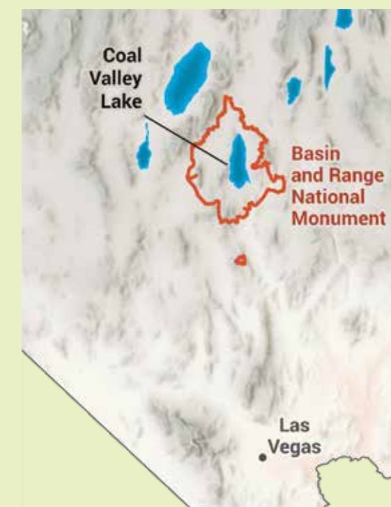
Pleistocene lakes of southern Nevada, 16,000 BP