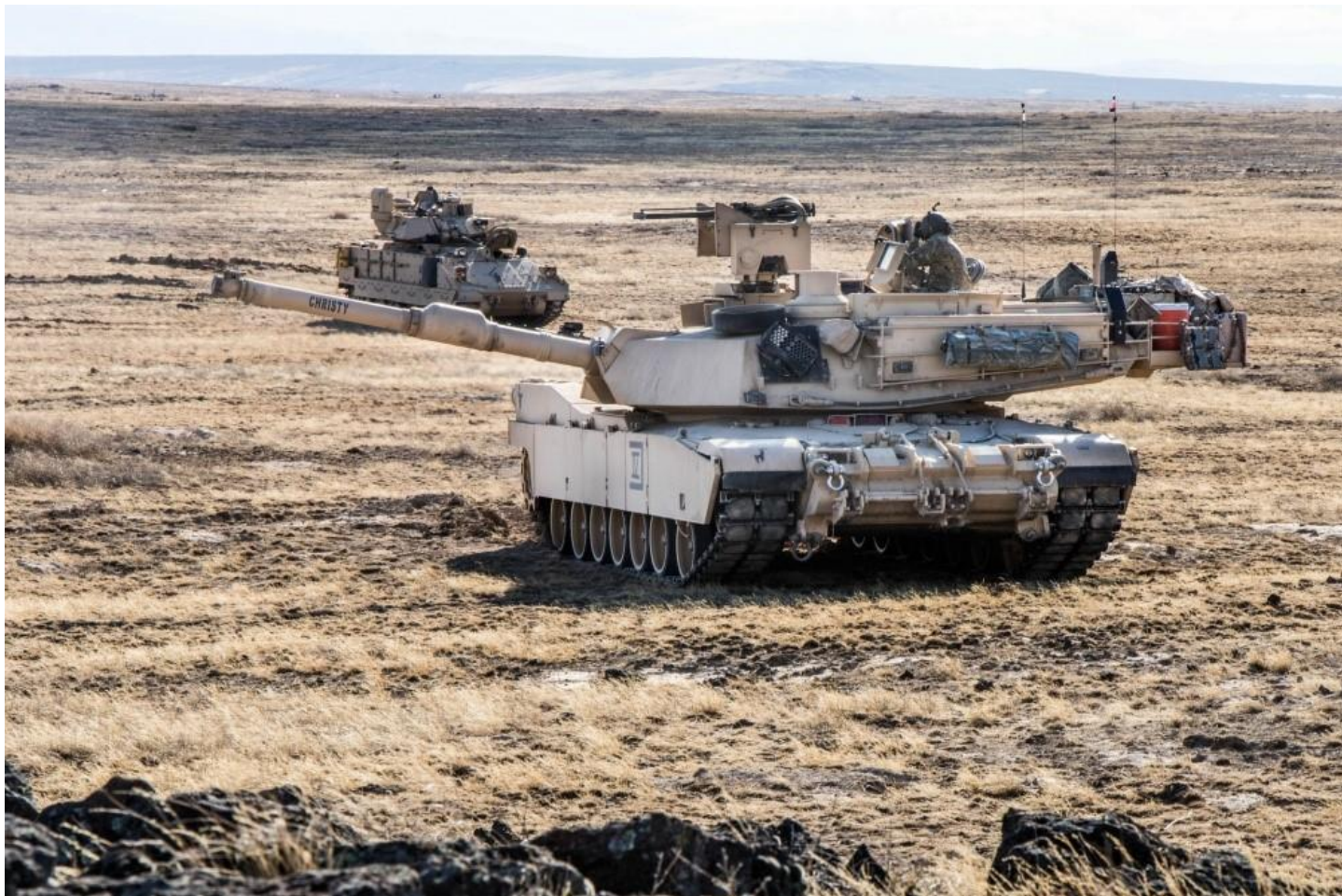
Photo caption: Idaho Army National Guard training in the Orchard Combat Training Center located within the NCA.

The NCA continues to maintain and build upon its work with the Birds of Prey NCA Partnership group, and in FY21 collaborated in podcast interviews, outreach, research, and native planting efforts. The NCA's ongoing partnership with Idaho Fish and Game supports seed collection and native planting efforts. In addition, the NCA implemented a new applied restoration project with the US Geological Survey and Idaho Army National Guard to test novel seeding application rates in an effort to improve rehabilitation efforts on previously impacted areas within the Orchard Combat Training Center.