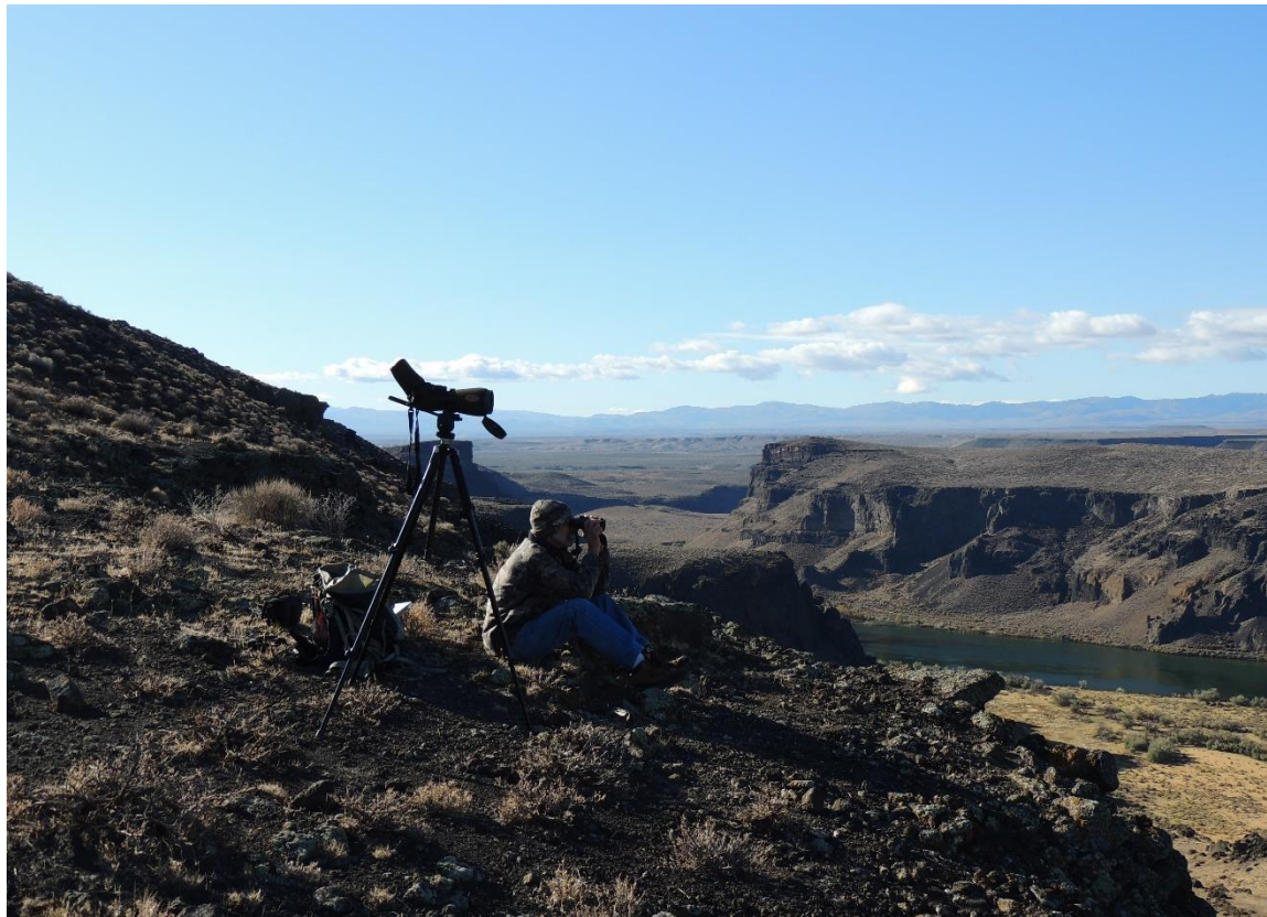
Photo caption: Wildlife Biologist doing Golden Eagle counts along the Snake River Canyon.

A collaborative project between Idaho State University, Boise State University Raptor Research Center, Idaho Army National Guard, and BLM has produced a new habitat suitability model for golden eagles. The suitability model was generated using unmanned aircraft systems (UAS, i.e., drones) data and is based on terrain ruggedness, solar radiation, slope, and distance from crater floor. The model correctly predicted historical eagle nest sites in the Crater Rings nesting territory. Climate warming may influence nest site suitability over time given the importance of solar radiation in predicting nest sites. These results provide important information about the status of golden eagles on BLM-managed lands in the NCA and in southern Idaho and contribute to the long-term monitoring and management of eagles.