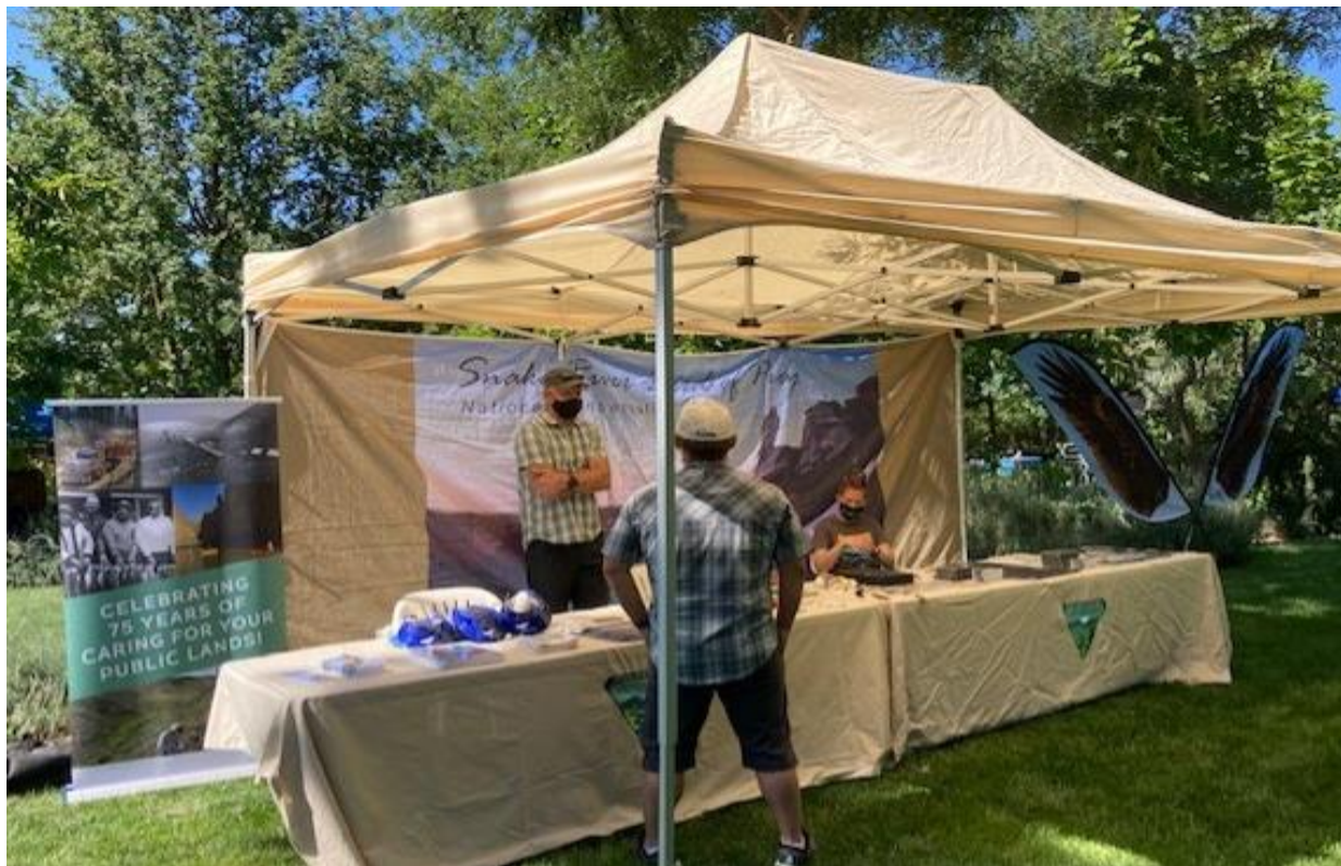
Photo Caption: NCA staff talking to members of the public at Raptor Fest in August 2021.

The NCA staff participated in the 4 th annual Raptor Fest event on August 28th. Raptor Fest is an annual family-friendly event hosted by the NCA's friends' group, the Birds of Prey NCA Partnership, that celebrates raptors and other wildlife, cultural resources, and the people and organizations that work in the NCA and Treasure Valley of Southwest Idaho. As part of this event, the NCA staff participates in public fields trips to the NCA and hosts a booth where the public can learn about the NCA, engage with staff, and meet our education raptor ambassadors.