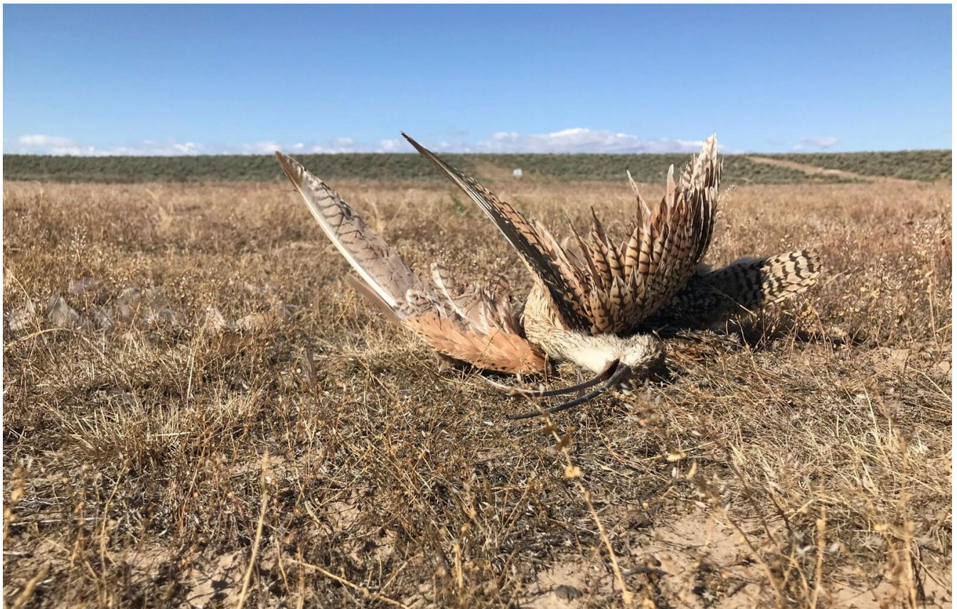
Photo Caption: a long-billed curlew that was found shot on the NCA.

One of the key challenges NCA staff are faced with is understanding how anthropogenic pressures, climate change, wildfire and habitat degradation may interact and impact resource conditions and raptor populations. The NCA staff continue to work with partners to highlight these issues and identify potential management solutions.