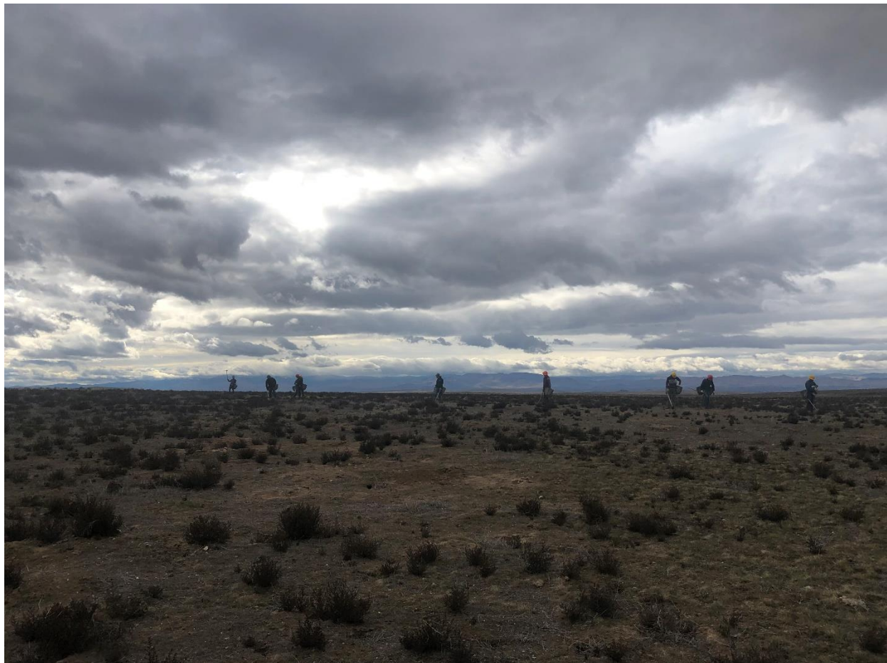
Photo Caption: contracted workers plant sagebrush in the NCA in October 2021.

An NCA canyon-wide prairie falcon survey was conducted in collaboration with the Idaho Army National Guard to assess breeding occupancy and reproductive productivity for first time since 2002. . The large nesting population in the Snake River Canyon is one of the main reasons the NCA was established. Results provide data on the current population status of prairie falcons in the NCA which can be used by the BLM, other agencies, and the public.