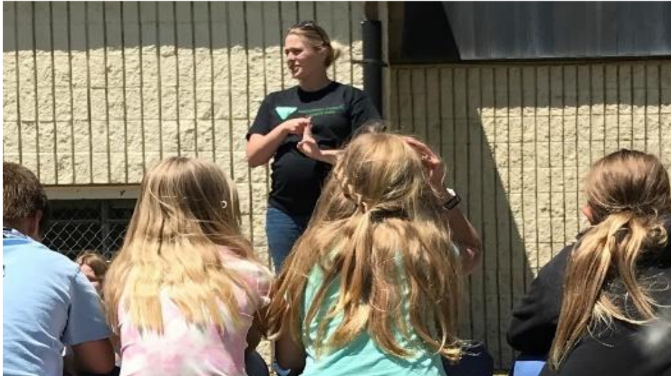
Photo caption: Environmental Education Specialist talks to students about the NCA. Below Outdoor Recreation Planner talking to students about a Swainson's Hawk.

The NCA education program continued to adapt to the changing school and community environments during the COVID-19 pandemic in order to provide quality programs. To continue to bring live raptor ambassadors to students, the NCA developed an interactive Virtual Field Trip for students learning from home and at schools. The NCA also worked with a local partner, Celebration Park, to create and deliver Virtual Winter Desert Ecology field trips.