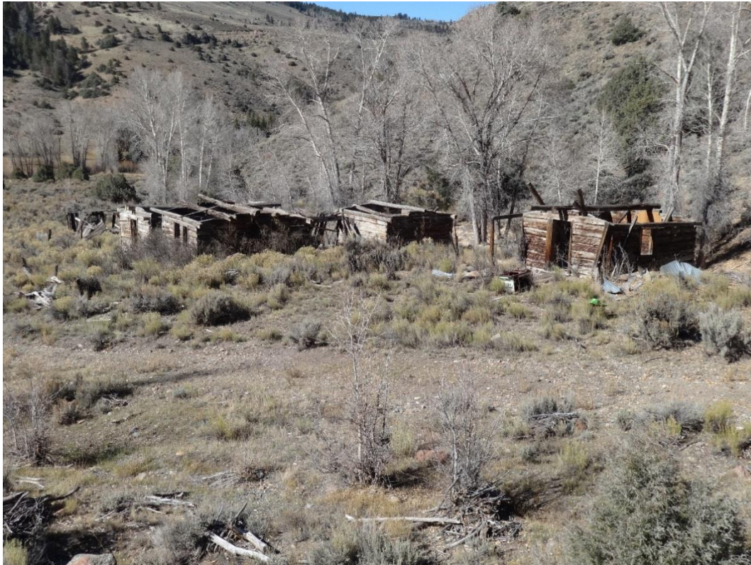
Carr Ranch today.

The site is regularly visited by heritage tourism enthusiasts and its central location just off Hwy 149 between Gunnison and Lake City, makes it an easy side trip for visitors heading to and from the Alpine Loop Scenic Byway. The site features an interpretive panel that was created in 1998 with the assistance of members of the Carr Family. HSAs of these structures will pave the way for long term preservation, management, and interpretive needs for the Johnson Stage Station. The final goals of this project are to have stabilized and interpreted structures that are not only safe for visitors to enter and tour but that will be able to withstand many harsh winters in the future.