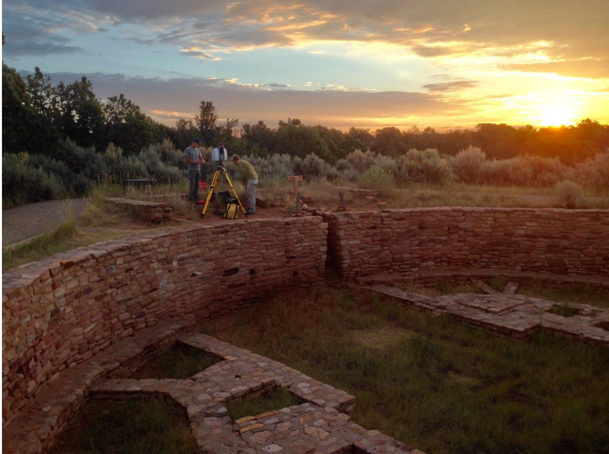
Staff and students of the University of Colorado at Denver School of Architecture and Planning's Center of Preservation Research and CANM continued work implementing the Monument's Digital Documentation Protocol at Lowry Pueblo National Historic Landmark (5MT1566), Canyons of the Ancients National Monument, Colorado.