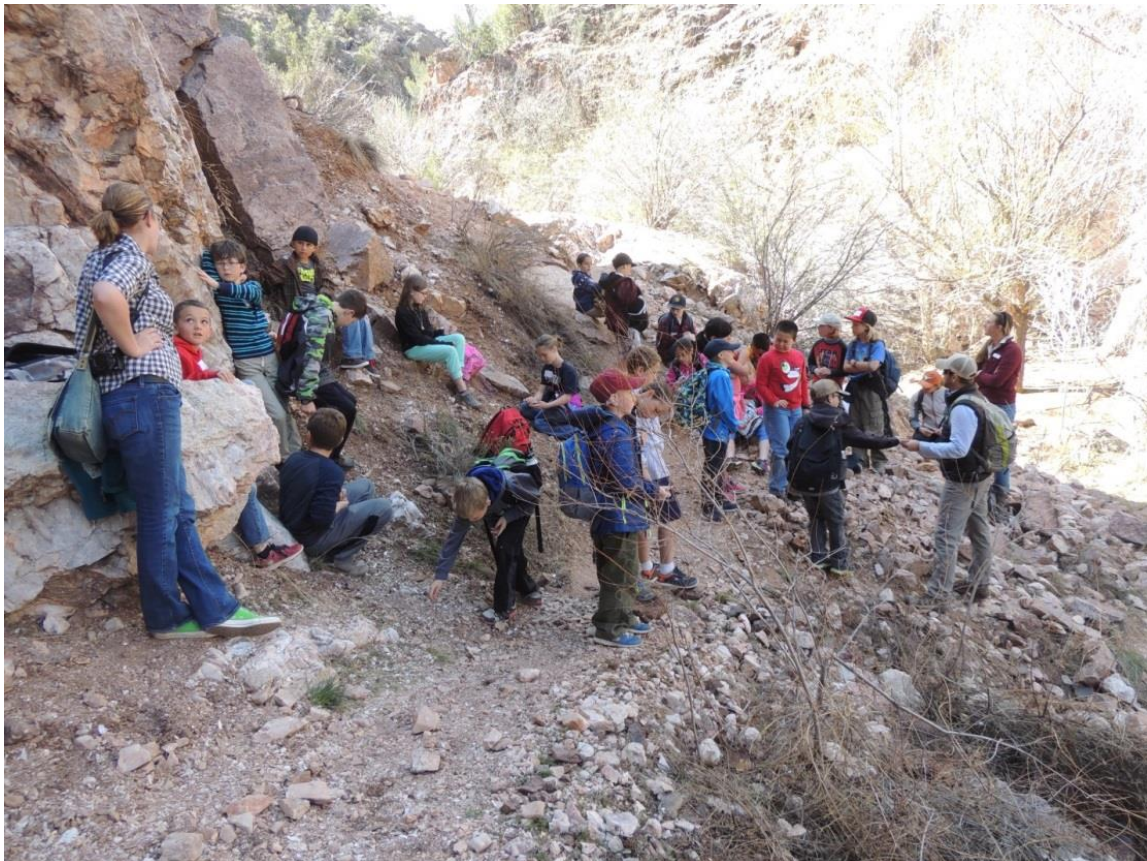
BLM staff and kids enjoy a moment's rest in the cool shade of the Mica Mine.