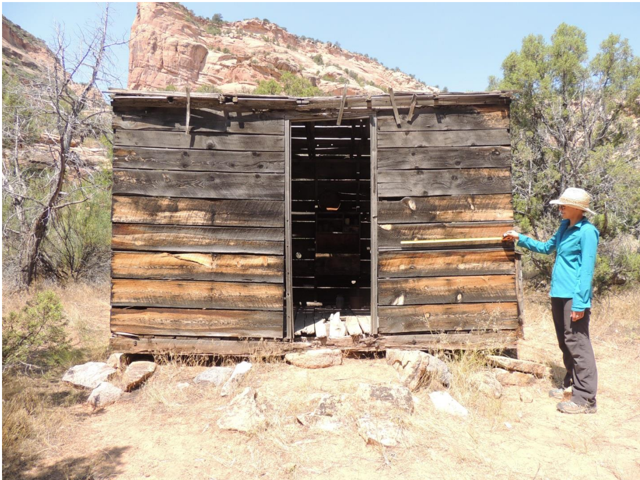
Natasha provides the scale for the monitoring of the Pollock Canyon Cabin 5ME653.

BLM began work on a project to rehabilitate and stabilize Skinner Cabin, a stone house built in the early 1900s in the MCNCA front country. Partnering with Historicorps, a non-profit that preserves historic properties, work on the cabin will be completed in September 2016. BLM has also partnered with the Museum of the West to provide interpretive kiosks along the trail to the cabin, outlining its unusual history. Once stabilization is complete, BLM will work with Colorado Canyons Association, a local non-profit that works with the area's NCAs, to build a protective fence around the cabin. This project is scheduled for Public Lands Day, September 24 th , 2016.