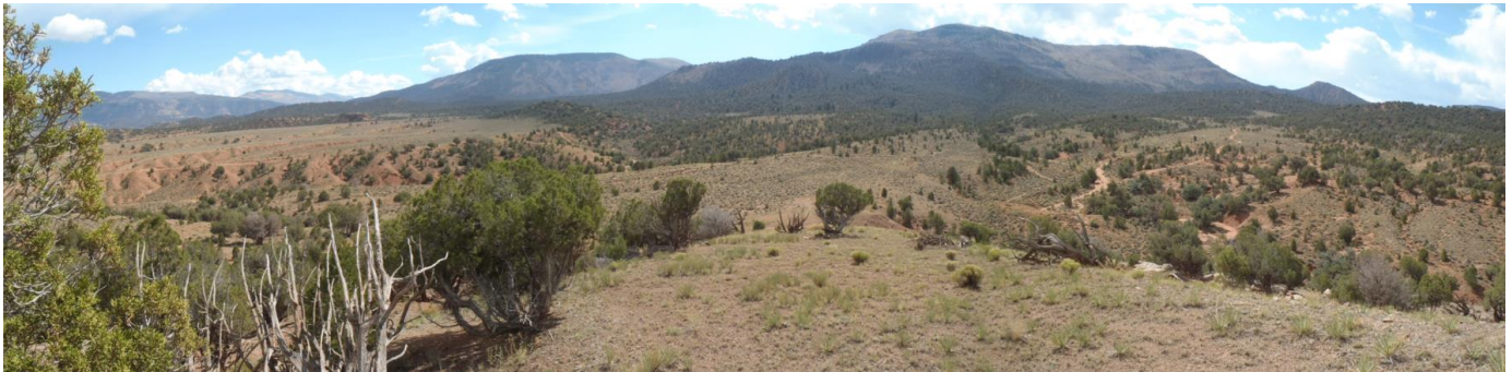
Panoramic overview of the Pisgah study area looking south toward Pisgah Mountain.

Protohistoric/ Historic Ute occupation of the area include: diagnostic Desert side-notched and Cottonwood Triangular points and a Leaf-shape knife; a campsite with gun parts and Euroamerican tent poles associated with a metal lance point and other Ute artifacts; four brush game blinds associated with game trails, and several other sites with the configuration of Numic camps. The Dotsero Section proved less productive based on a low number of sites and isolates and a lack of diagnostic artifacts. The low site density may be attributed to the lack of springs in the immediate vicinity and to the high relief of the terrain.