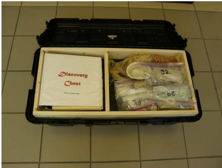
Inside the Discovery Chest.