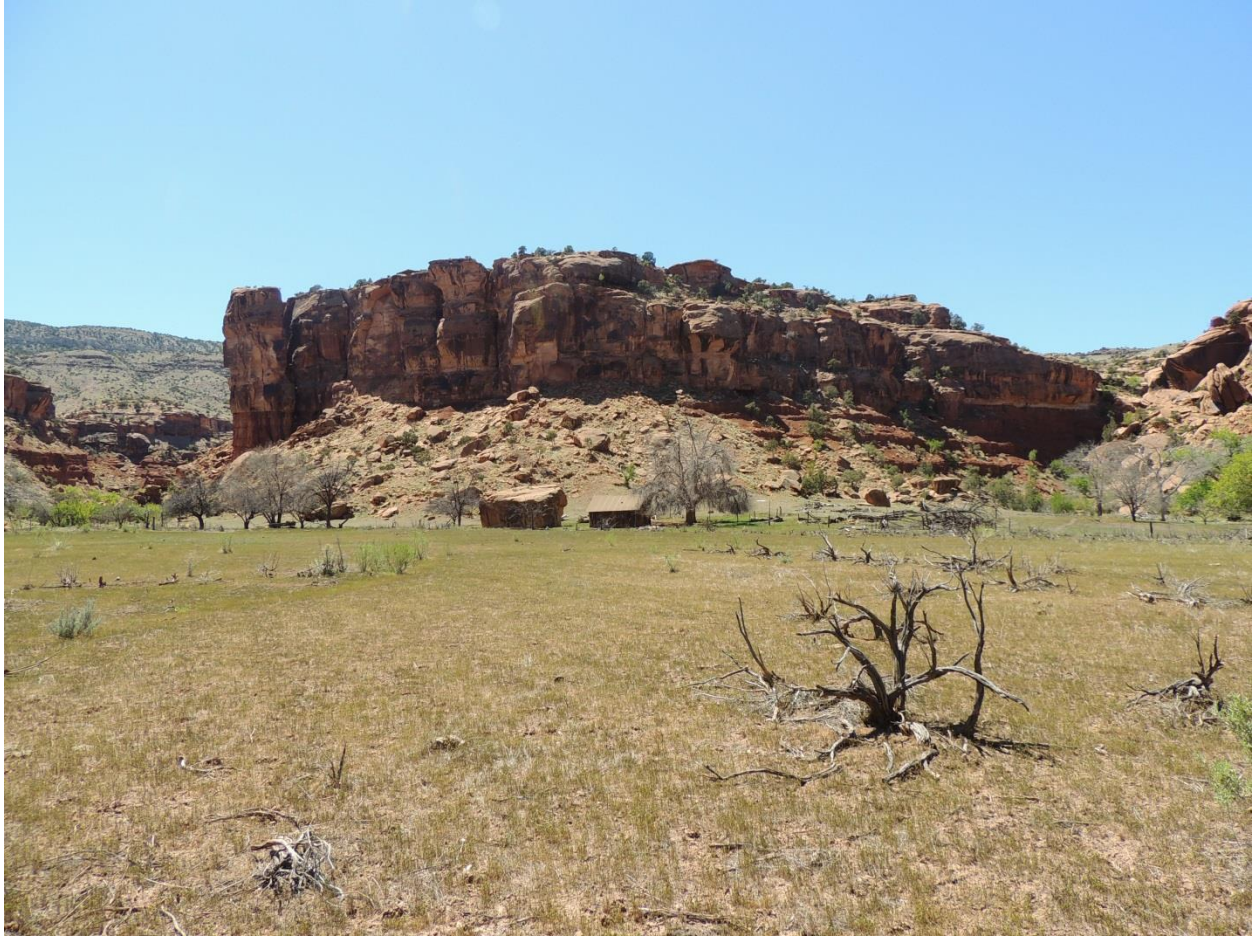
Rambo Homestead in Little Dominguez Canyon.