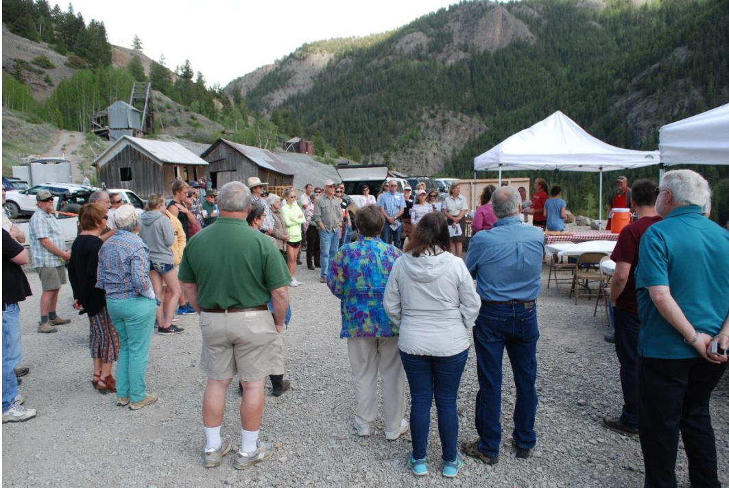
Ute Ulay site public celebration of NHPA 50 th anniversary.