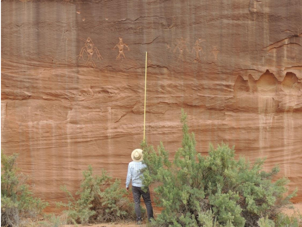
Monitoring rock art in the NCA.