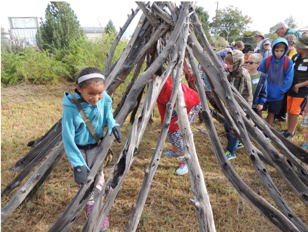
Children enjoy learning about wickiups at the Ute Learning Garden.

The activities associated with the “Learning Garden” have expanded over the years. It is used year-round by schools groups, families, senior groups, and clubs from the local community. Field trips are offered in June and September for school groups on public land. Craft sessions are periodically presented for children. Master Gardener docents are now trained to help maintain the garden. More importantly, the fundamental component of the program thrives; bringing Ute Indian Tribe elders and youth back to their aboriginal homeland and for elders to teach children about their traditional ways.