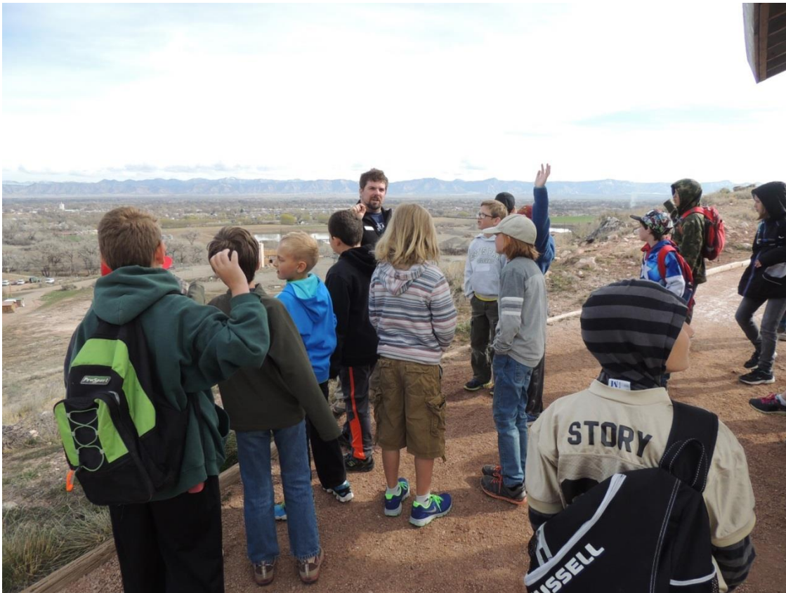
Students in McInnis Canyons National Conservation Area learning about local geology and paleontology.