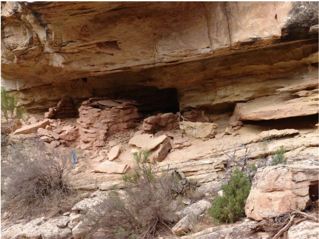
Fremont granary in rock shelter near Skull Creek.

In partnership with Colorado State University (CSU) the White River Field Office (WRFO) hosted a 12 day archeological field school in the Miller Creek Archeological District (5MF 2016). The project provided teaching, training, and research opportunities for undergraduate and graduate students and faculty from CSU. Approximately 24 Students from CSU participated in the field school. Students carried out minor systematic testing of a Fremont era pit structure, and a previously looted rockshelter to locate intact buried cultural. Students also learned photogrammetric (3-d) mapping at several of the better preserved corn storage granaries. Photogrammetric mapping will create 3-d models of features that can be used for public interpretation, condition assessment, and volumetric research on granary size. Lastly, students were able to participate in Class III survey to look for previously undocumented cultural resources alongside WRFO archaeologists. On the last day of the field school member from the Colorado Archaeological Society (CAS) Vermillion Chapter in Craig, Colorado visited the excavation and several of the granaries.