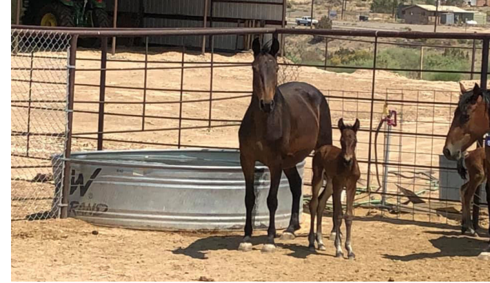
Mares and colts at the Bloomfield, NM, corral in Carson National Forest.

Modoc National Forest is home to the temporary Double Devil Wild Horse corral system that could be expanded or made more permanent.