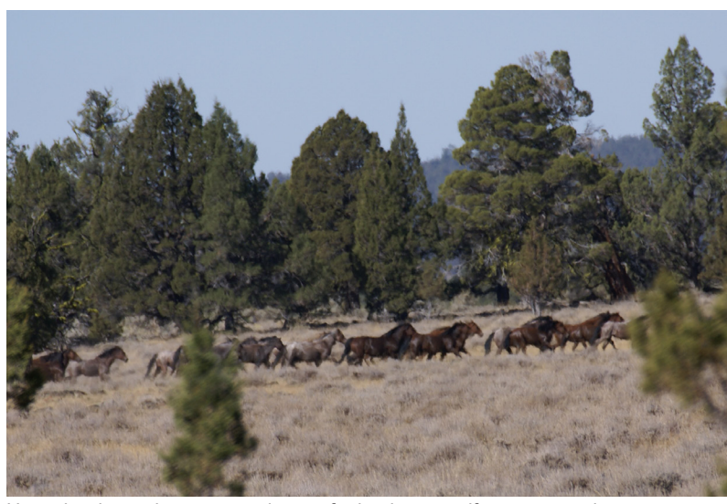
Horse herds can become a nuisance for land owners if not managed properly.