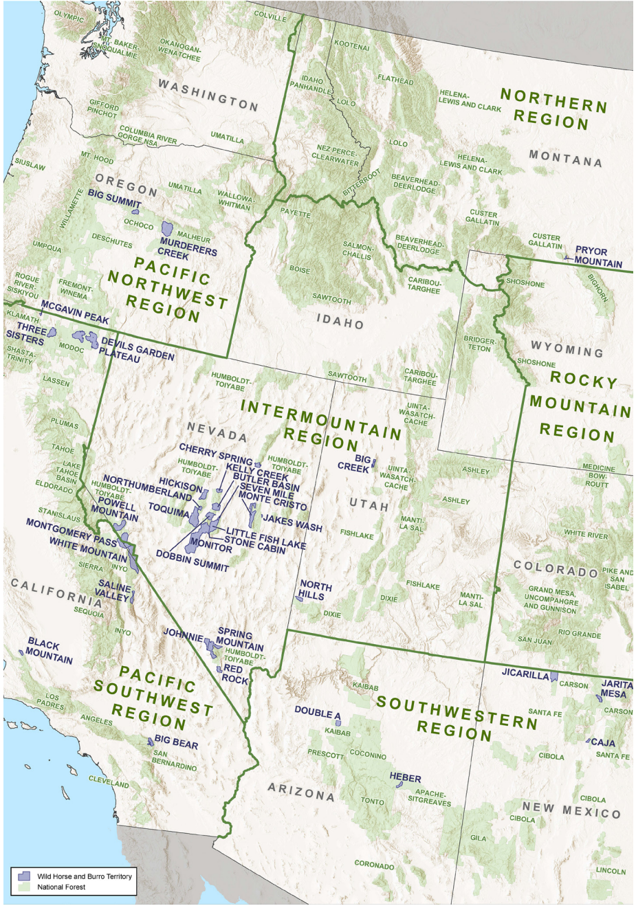
A map of the active wild horse and burro territories in the USDA Forest Service.

The USDA Forest Service Wild Horse and Burro Program objective is to maintain thriving, wild free-roaming horse and burro populations in ecological balance with national forest and rangeland ecosystems.