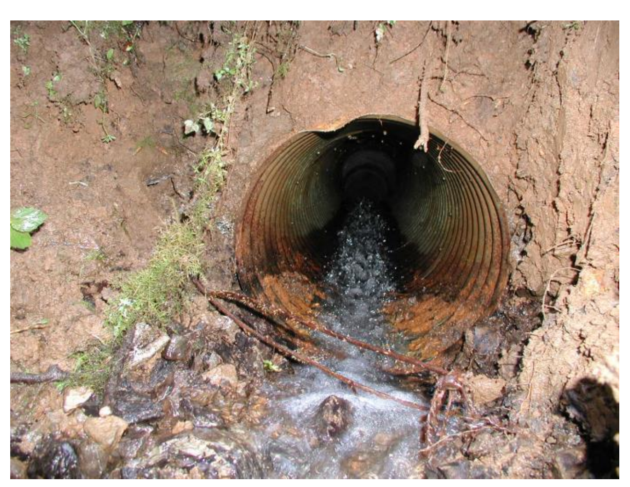
Culvert at North Fork Alsea Access Road.