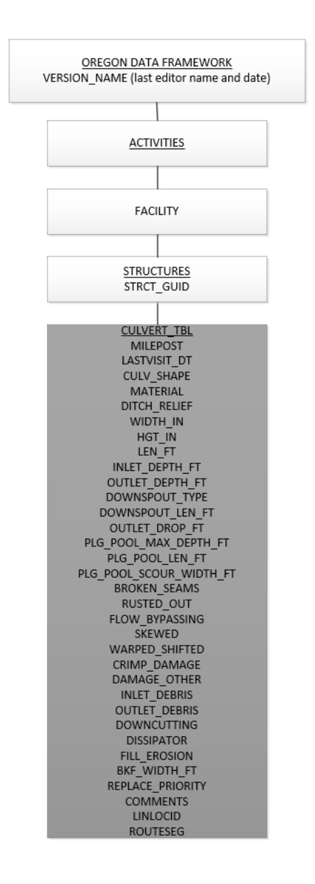
Figure 2 Data Organization Structure