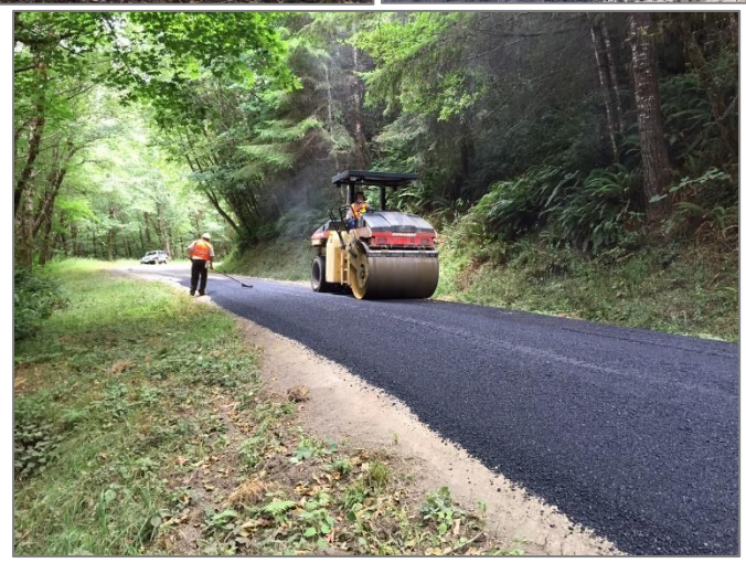
Rolling, dumping, and blading asphalt.