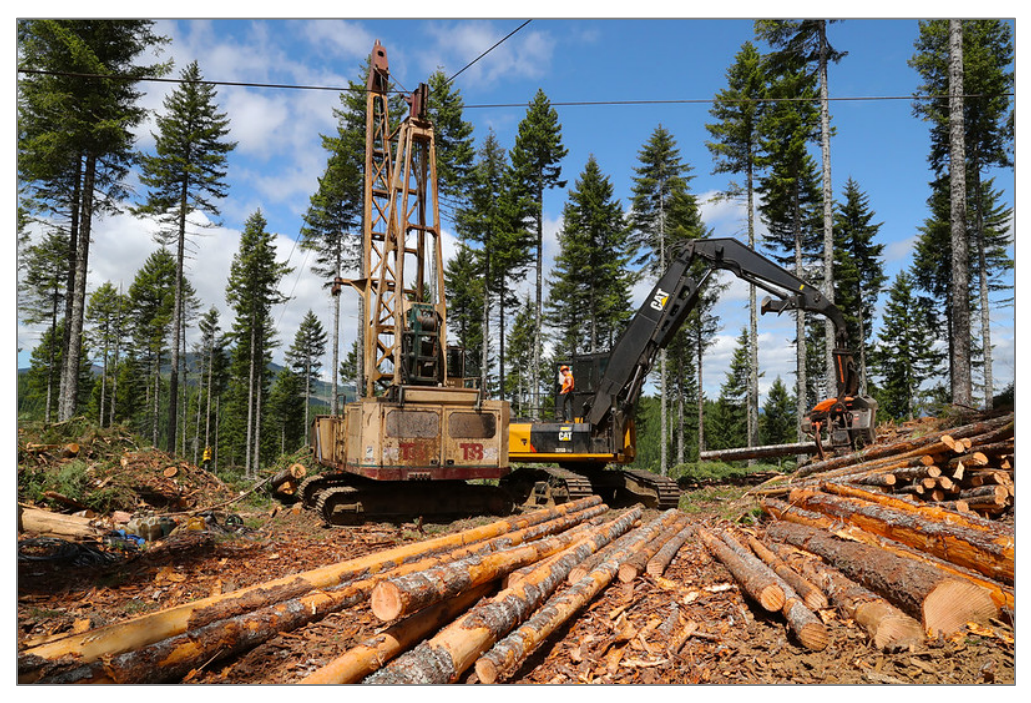
Rowell Creek Timber Sale, June 2018.