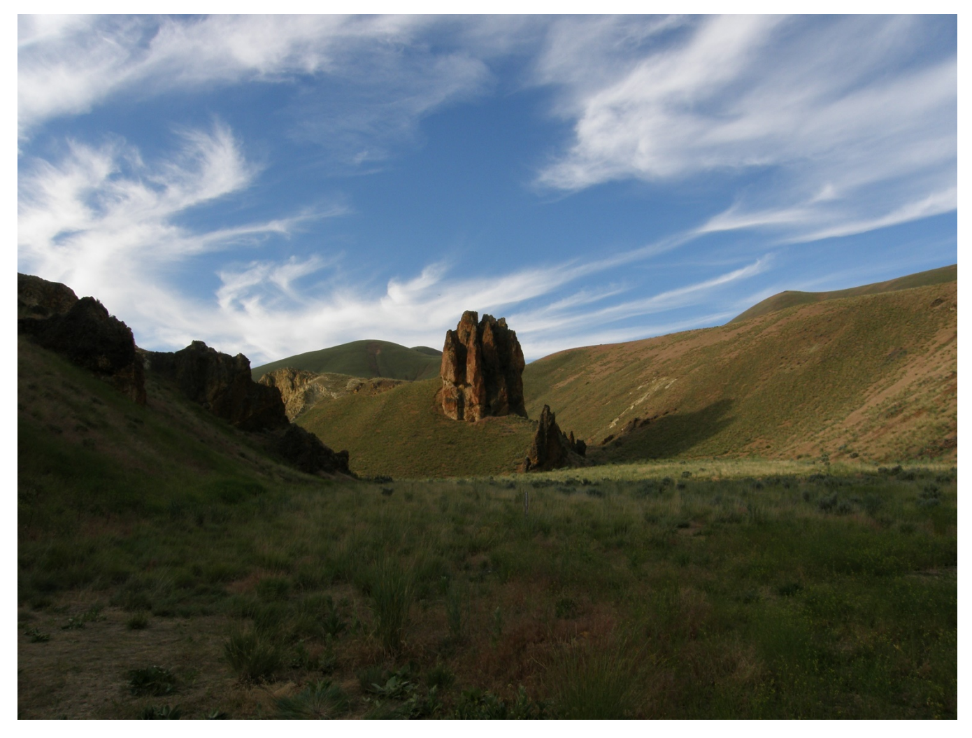
Leslie Gulch in Owyhee Canyonlands