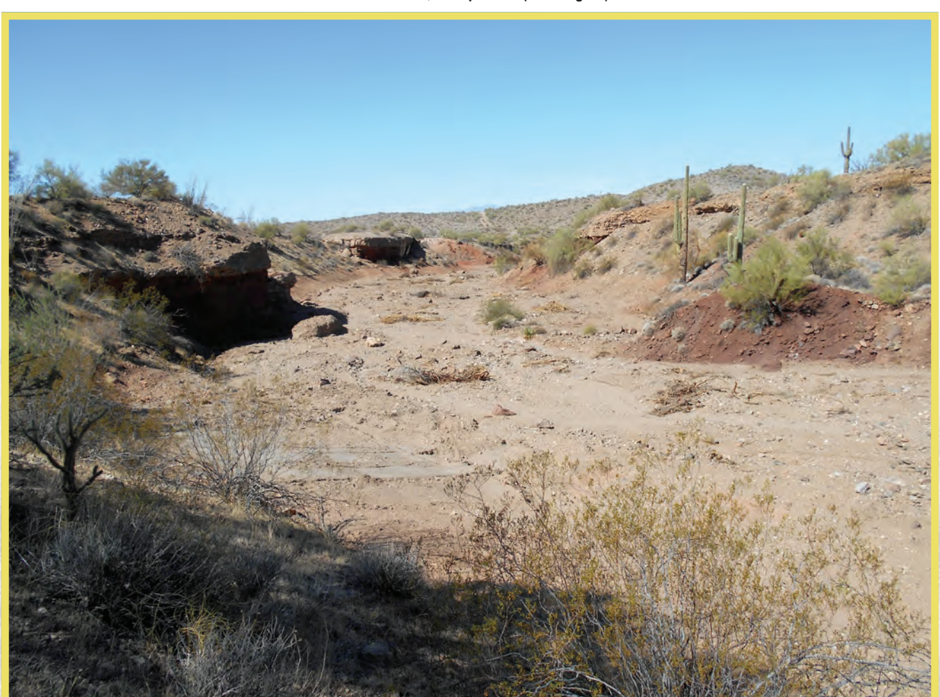
2017 Hardrock Mineral Environmental Award winner, Teck American, Incorporated (Washington)