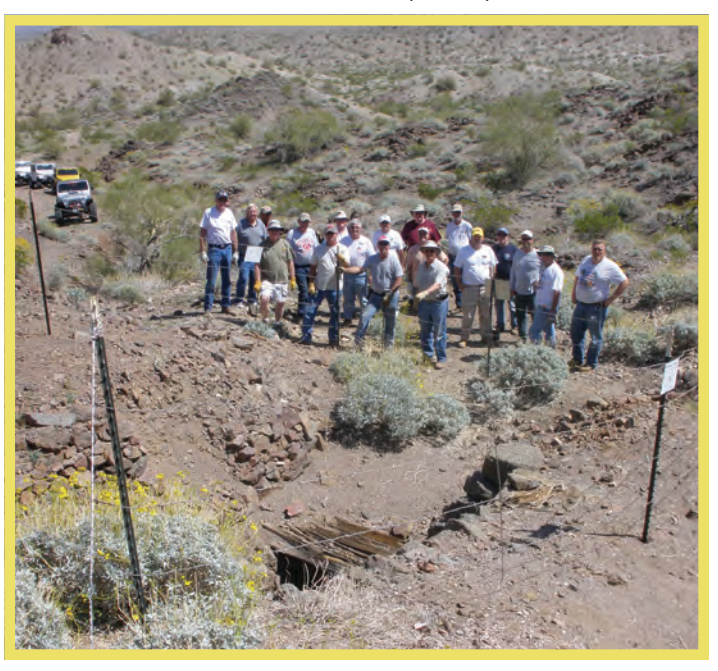
2017 "Fix A Shaft Today!" (FAST!) Award winner, Havasu 4 Wheelers (Arizona)

Nominations are to be made by FAST! sponsors or organizations familiar with the completed activities. Nominations should provide a succinct description of the challenges related to the FAST! project, the nominee's achievements or contributions, and the subsequent results. Estimated cost savings to the government may be included.