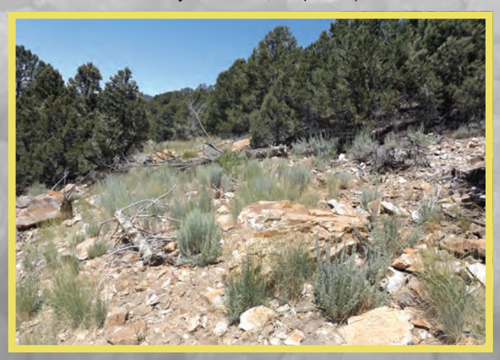
2017 Hardrock Mineral Small Operator Award winner, Tertiary Minerals US, Inc. (Nevada)