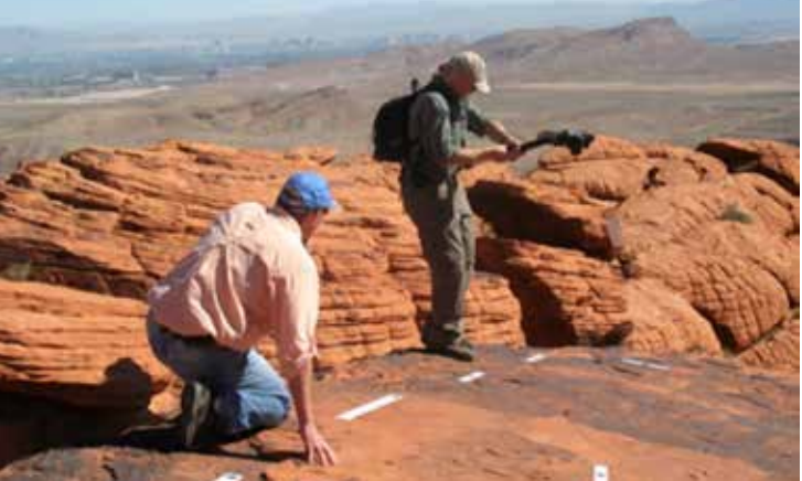
BLM paleontologists survey a dinosaur trackway at Red Rock Canyon National Conservation Area, Las Vegas, Nevada.

Paleontological resources are an important part of America's heritage, garner much positive press for the BLM, and are an important source of scientific information concerning the history of life on Earth and changes in climate over time. The BLM is required to preserve paleontological resources using scientific principles and expertise (Paleontological Resources Preservation Act, 16 U.S.C. 470aaa) while accommodating multiple and diverse resource uses under the Federal Land Policy and Management Act. Data about paleontological resources on public lands have been systematically collected for more than 150