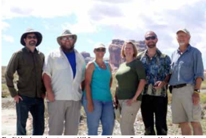
The BLM paleontology team at Mill Canyon Dinosaur Trackways, Moab, Utah.