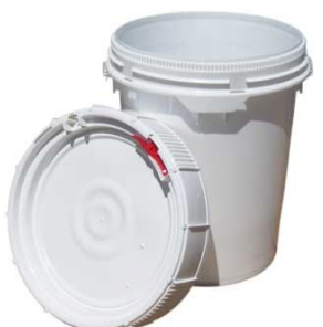
Life Latch Bucket & Lid