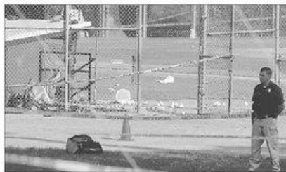
A police officer guards the field where a gunman opened fire on members of a Republican baseball team. Capitol Police serving as security for a congressman stopped the shooter as he advanced toward people hiding in a dugout.