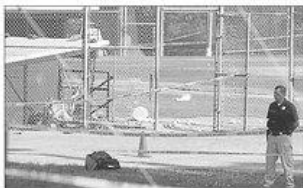
A police officer guards the scene after a gunman opened fire on Republican members of Congress during a baseball practice in Alexandria, Virginia, on Wednesday.

Senior House member, three others hurt; shooter dead