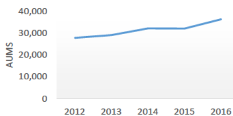
Figure 3. BLM AUMs Billed, 2012-2016