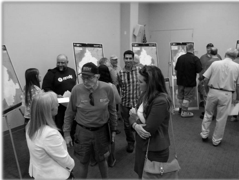
Monument staff at a scoping meeting in Las Vegas, Nevada

The Ely District Manager, Public Affairs Specialist, Rangeland Management Program Lead, Rangeland Management Specialists, Archaeologist, and GIS Specialist spent time working on the Monument in FY16. An Inter-Disciplinary Team (ID Team) was assigned to work on the Basin and Range National Monument Resource Management Plan (RMP). The ID Team is composed of approximately twenty BLM employees within the Ely District who are developing and authoring the RMP for the Basin and Range National Monument (BARNM).