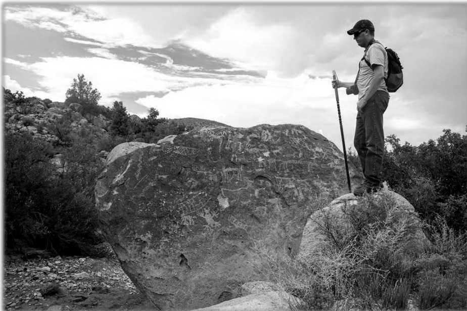
Petroglyphs at Shooting Gallery rock art site

Of the 709 resources documented, there is a single property listed on the National Register of Historic Places (NRHP), which is the White River Narrows Archaeological District. There are 272 properties eligible for the NRHP. There are 405 properties that are not eligible for the NRHP. The remaining 31 properties have not been evaluated for their eligibility to the NRHP. Completion of the Class I Inventory and draft Historic Context for the BARNM is anticipated in FY17.