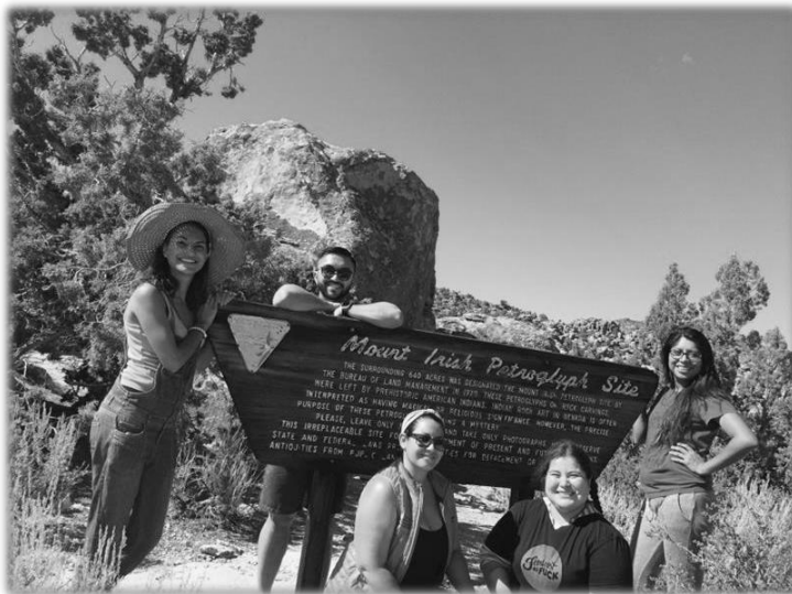
Friends of Basin and Range

monitoring cultural resources. The Friends of Basin and Range spent time supporting the Monument in FY16. Activities included trash clean-ups, graffiti removal projects, and outreach and support for the area.