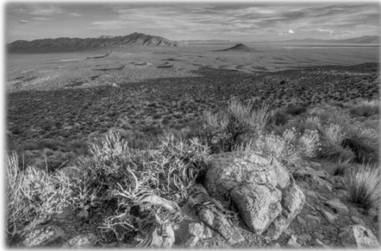
Natural resources in the Basin and Range National Monument