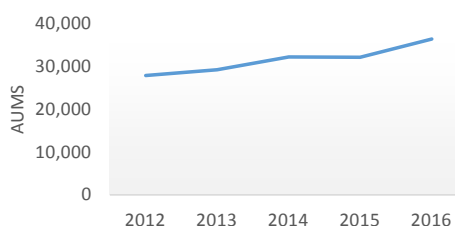
Figure 3. BLM AUMs Billed, 2012-2016 (BLM)

additives. The world potash market in 2016 was marked by weak demand in the first half of the year, mainly in China and India, the largest consumers of potash. This excess supply resulted in lower prices, and reduced production. The average price of potash in 2016 was $360 per ton.