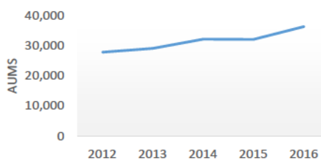
Figure 3. BLM AUMs Billed, 2012-2016 (BLM)