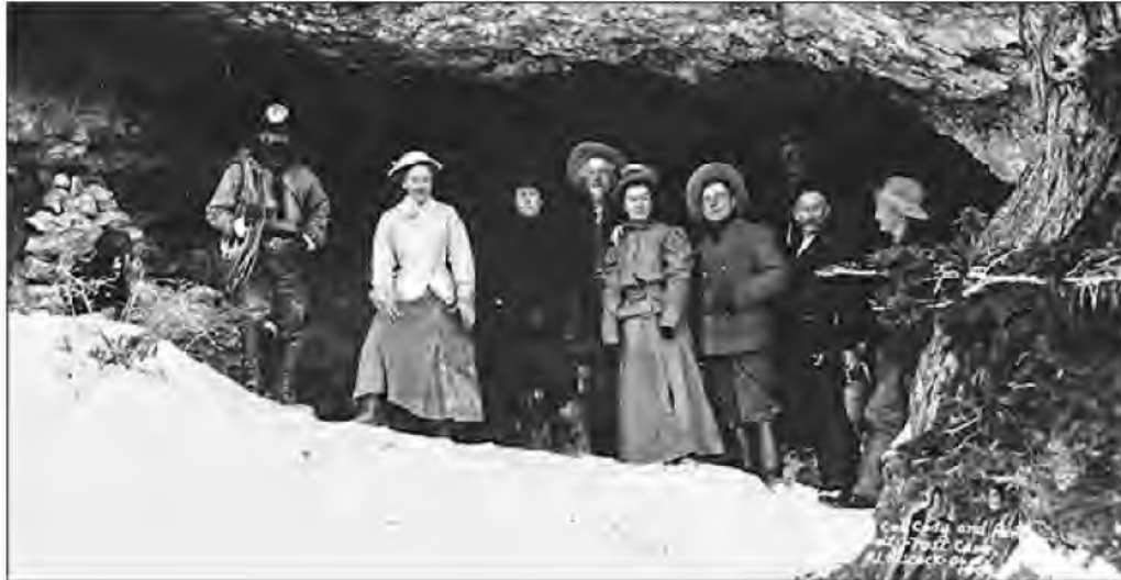
Col. William F. "Buffalo Bill" Cody, center, and others visited Spirit Mountain Cave in 1909.

More than 1,100 people make their way up Cedar Mountain in Wyoming each year, trekking 3 miles west of Cody and up a gravel road to explore the expansive Spirit Mountain Cave.