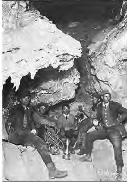
Early cave explorers pose in the main passage of Spirit Mountain Cave.

News reports indicate that the dilapidated structure, which is not open to the public, was sold in 2011 to a local chapter of the Sons of Confederate Veterans for a nominal sum of $10.