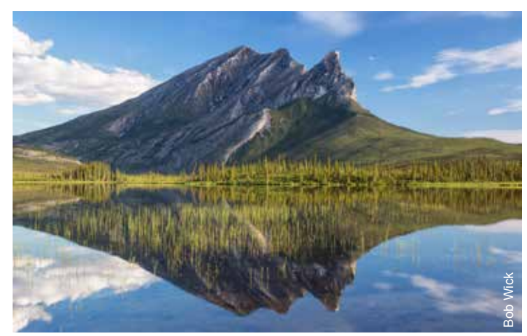
Sukakpak Mountain sparkles in this reflection from the north.

One of the most visually stunning ACECs is Sukakpak Mountain (MP 203 of the Dalton Highway). A massive wall of Skajit Limestone rising to 4,459 feet (1,338 meters) that glows in the afternoon sun, Sukakpak Mountain is an awe-inspiring sight. Peculiar ice-cored mounds known as palsas punctuate the ground at the mountain's base. "Sukakpak" is an Iñupiat Eskimo word meaning "marten deadfall." As pictured here from the north, the mountain resembles a carefully balanced log used to trap marten. The BLM designated this area in 1990 as an ACEC to protect extraordinary scenic and geologic formations.