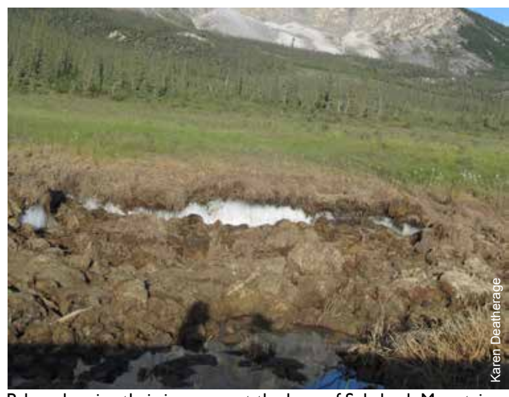
Palsas showing their ice cores at the base of Sukakpak Mountain.