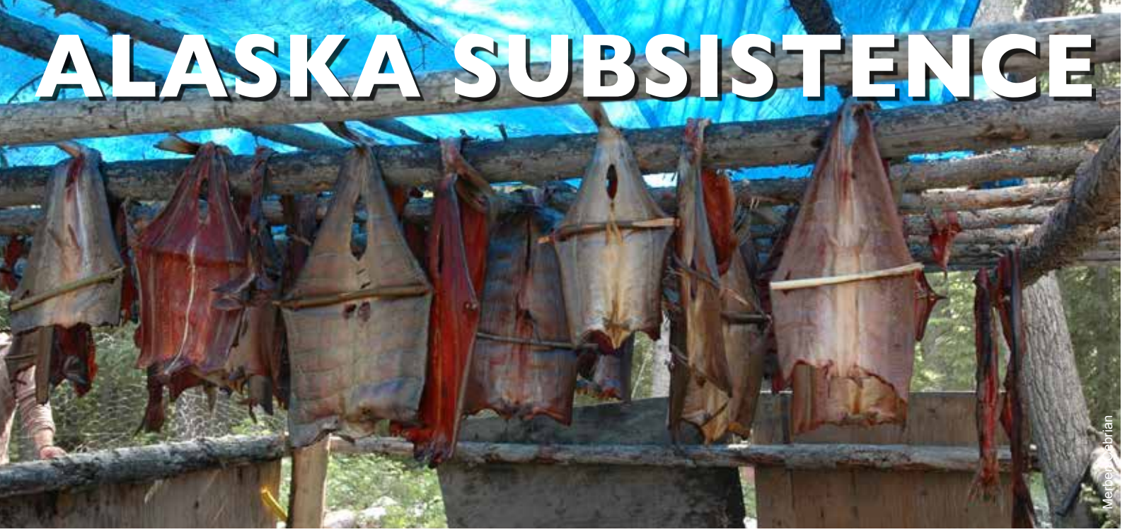
Preserving red salmon using the traditional drying method.