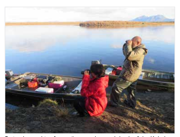
Patiently watching for caribou on the south bank of the Kobuk River at Onion Portage.