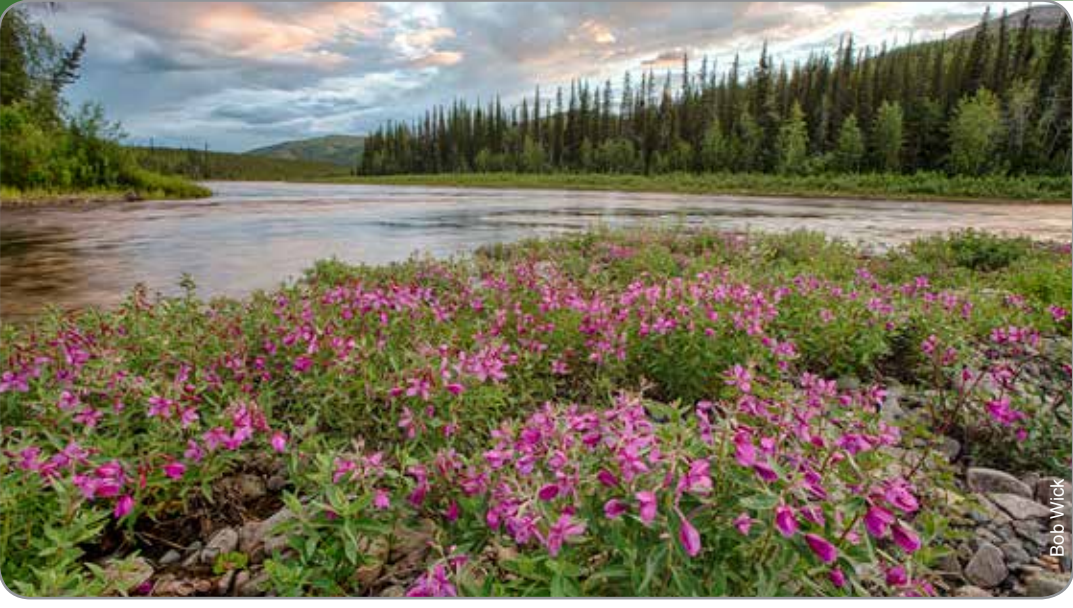
Beaver Creek Wild and Scenic River in White Mountains National Recreation Area.