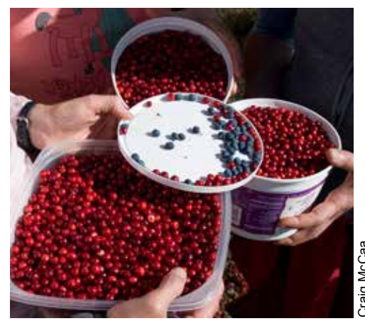
Harvesting berries like these cranberries, provides a good source of vitamin C to use through the long winter ahead.

A subsistence lifestyle means survival, perpetuating cultural or social ways of life, and an ability to share harvests among family and neighbors. Life in rural Alaska often depends on filling pantries and freezers. In a land where winter dominates, subsistence is necessary for survival, quality of life, and the continuation of who Alaskans are as a people.