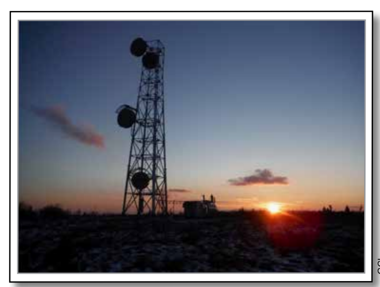
Grant Creek repeater site

and injection wells on a single well pad at GMT1, a gravel road for access, and will substantially reduce potential impacts of aircraft overflights local communities and subsistence users are concerned about, GMT1 would facilitate the first production and transportation by pipeline of oil from federal lands in the NPR-A. You can find out more at http://www.blm.gov/ak/GMTU1.