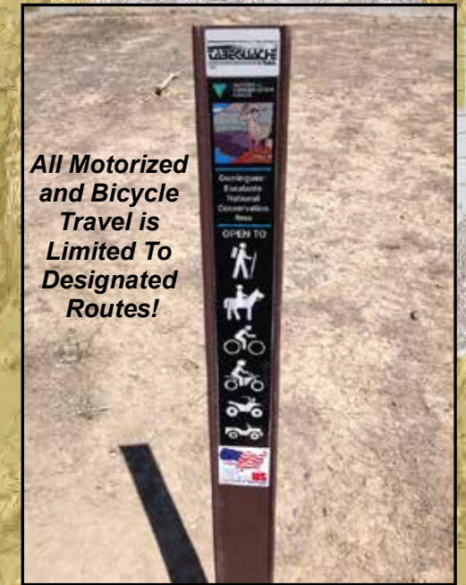
All Motorized and Bicycle Travel is Limited To Designated Routes!

0 1 2 3 4 Miles Map Scale 1:58,000 This map was produced by the BLM DENCA - January, 2019 Document path: T:\COGIS\sw\denca\projects\transportation\travel maps\DENCA Travel Map Whole 10_2018.mxd NOTE TO MAP USERS No warranty is made by the Bureau of Land Management as to the accuracy, reliability, or completeness of the data layers shown on this map.