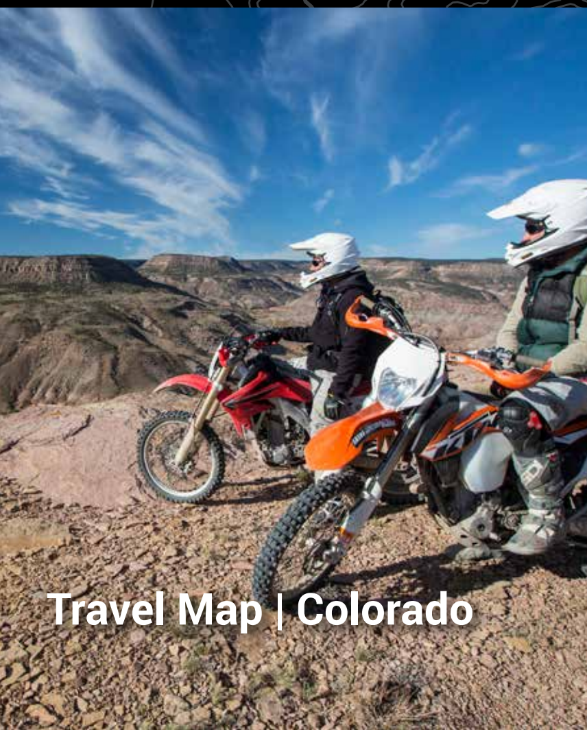
Travel Map | Colorado

BLM/CO/MA-19/002