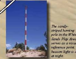
The candy-striped tower pole in the White Sands Play Area serves as a visual reference point. A beacon light is on at night.