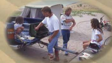
Dispersed camping is permitted throughout the Little Sahara Recreation Area. Please follow "Leave No Trace" camping techniques to preserve the beauty of the area.