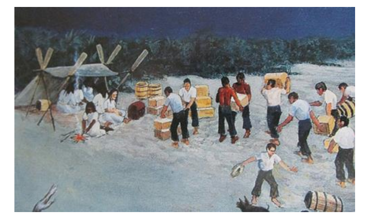
Jupiter Lighthouse came to be and the role it played through the years.

The Jupiter Inlet Lighthouse Outstanding Natural Area offers 5000 years of history contained in one location.