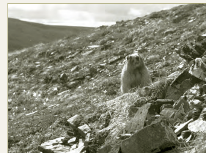
Hoary Marmot living among the tundra and rock scree.

and willow ptarmigan ( Lagopus lagopus ). Both are close relatives of grouse, but unlike their cousins, ptarmigan turn from brown to white with the seasons, making them difficult for predators to see.