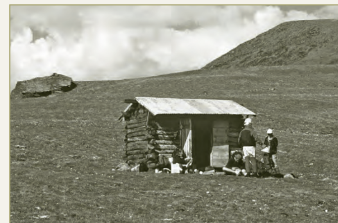
Ptarmigan Creek Shelter Cabin.

All of Alaska is bear country. Remember to watch for bears and other wildlife. Cooking should take place outside the shelter cabins so that animals are not attracted to them. Cook food away from sleeping areas and downwind from tents. Always keep a clean camp. Human waste should be buried at least 200 feet (60 m) from water sources, and all garbage, including toilet paper, should be hauled out. Please do not leave food in the cabins for the next people to pack out. Remember – “If you pack it in, pack it out.”