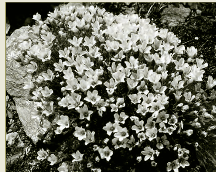
Arctic Sandwort growing on the rock scree.

Crowberry. ( Empetrum nigrum ) Crowberry Family. A mat-forming, evergreen shrub with small, narrow leaves and maroon flowers, producing an edible berry.