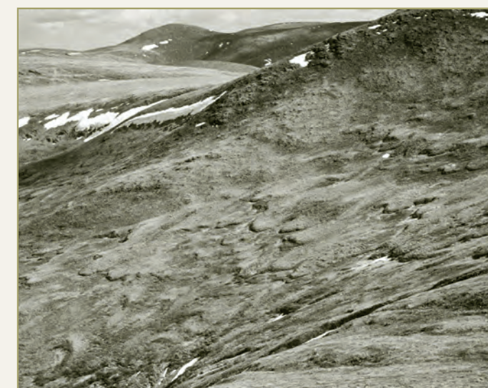
Solifluction lobes found in the Pinnell Mountain area.

Other permafrost-related features include polygon-patterned ground fissures and “seas of rocks,” created over thousands of years as frost pushes fractured rocks to the surface.