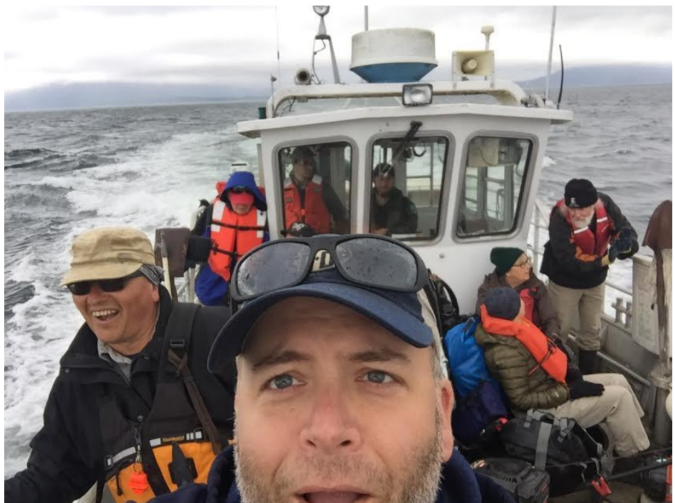
Washington Water Trails Work Party