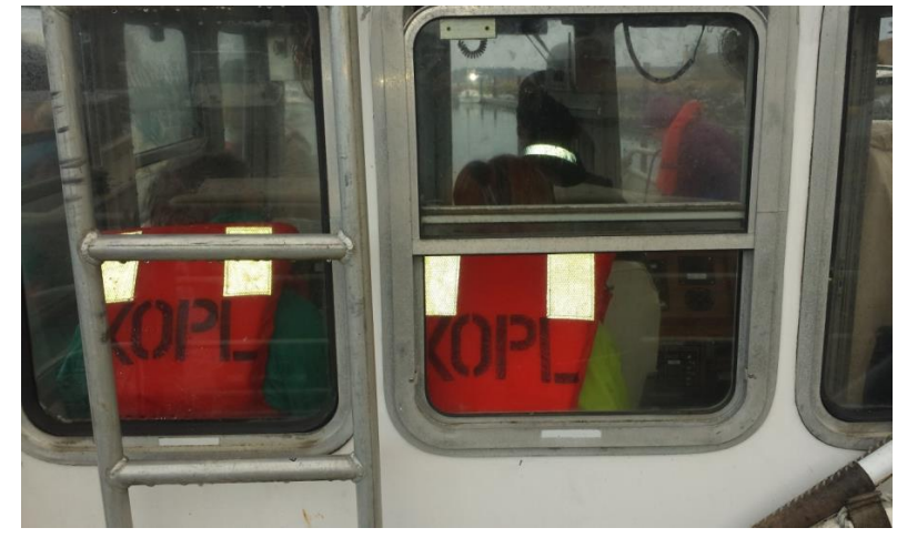
Work Party en route to Patos Island

for the lighthouse. Based on that process, key themes were