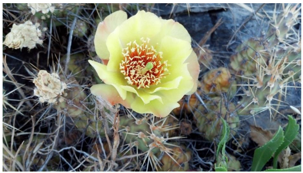
Lopez Prickly Pear

-Presidential Proclamation, March 25, 2013-