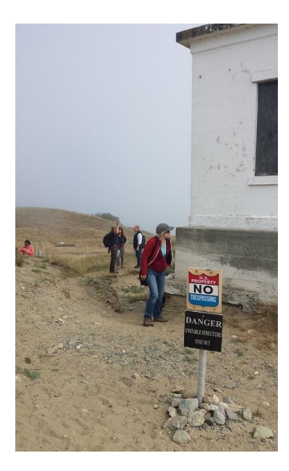
USCG has an internal directive with prioritization for the release of certain landscapes. The status of BLM management of the setting will not change and all transfers are anticipated to be completed before the end of the RMP process.

In FY16, work continued on final relinquishment of certain US Coast Guard (USCG) lands to the BLM. USCG made a visit to the San Juan Islands, primarily to appraise the engineering situation at Cattle Point, which they intend to repair with a new foundation before releasing that withdrawal. National Environmental Policy Act (NEPA) analysis of an easement across BLM-administered lands to reach USCG acreage was completed in 2016. While in the area, they also toured the Turn Point and Lime Kiln light stations.