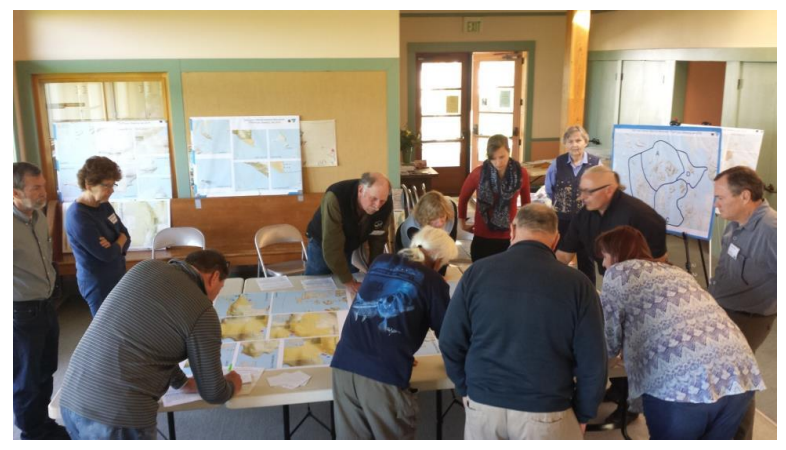
The Monument Advisory Committee weighs in on Human Use

In January we held Human Usefocused public meetings on Orcas, San Juan, and Lopez Islands, and in Anacortes. In total, 91 individuals provided 554 comments and there were nine additional emails and letters. In April at our next MAC meeting, we received additional comments from eight committee members and three members of the public. In all, 45 specific locations received comments with 19 locations receiving at least 5