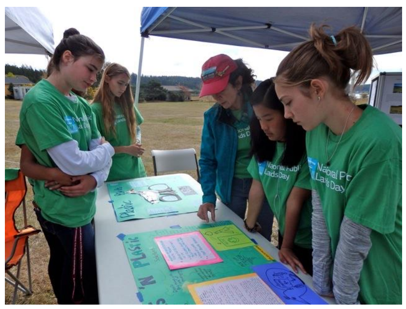
Spring Street School Tidal Plastics Study

This year has been the year for birds. Our National Public Lands Day celebrated the International Migratory Bird Convention, with birding stations and courses in photography and monitoring science. Our school partners and environmental science partners lead regular bird walks and post monthly counts, and beach cleanups are a means to protecting wildlife. The peregrine falcons returned to Watmough Bay after an absence of several years.