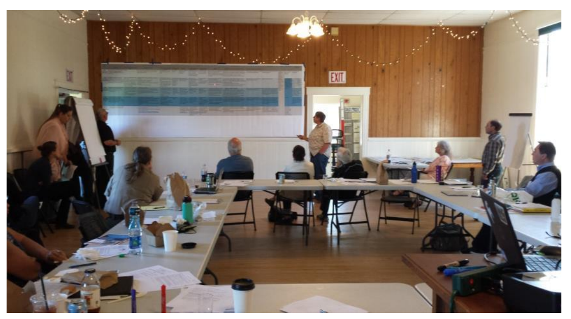
Cooperating Agencies consider Planning Alternative Components

With the MAC we devised a strategic plan and vetted products and process. We created a pre-meeting video which was posted online and circulated to hundreds through our newsletter. We developed a brief PowerPoint presentation to assist the public and our partners in a methodical system for perceiving and addressing the landscape. As there are no extractive uses present on the monument, the primary impact that we are planning for is human use, so we decided to frame the analysis in that light. The outreach meeting design was to inform them of the extent of monument landscapes, and encourage them to comment, request, inform, or advise on any and all properties. Also, because the Trails and Travel Management Plan is being created simultaneous with the RMP, our maps displayed all of the existing trails, prompting feedback and guidance from our local experts.