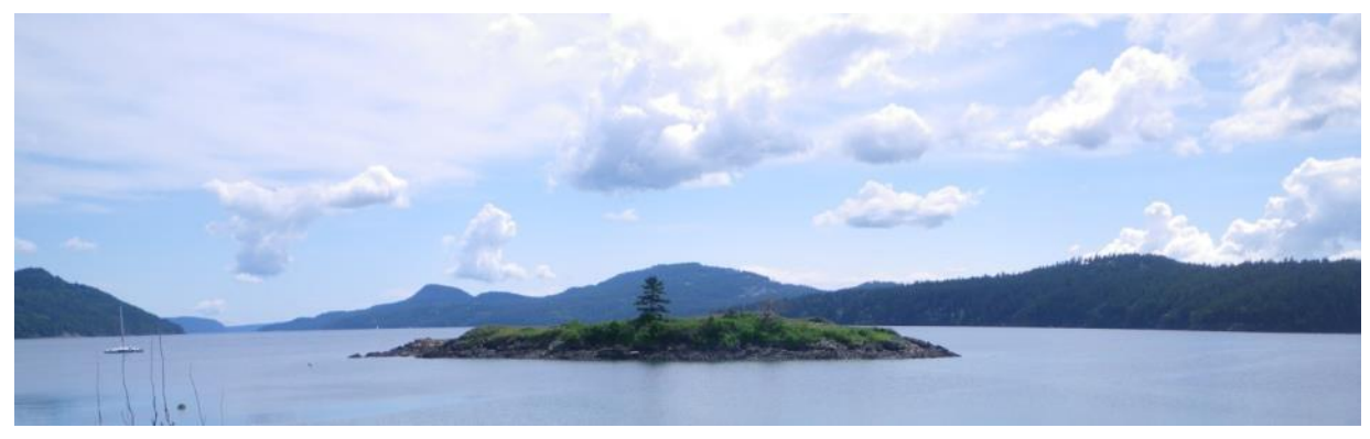
Indian Island, Eastsound, WA