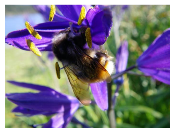
Camas flower and Bee

FY17 programming in advance rather than speculating on agency budgets. In anticipation of funding challenges, the monument is entering into an assistance agreement with Lopez School District in order to pool funds to sustain the program over time.