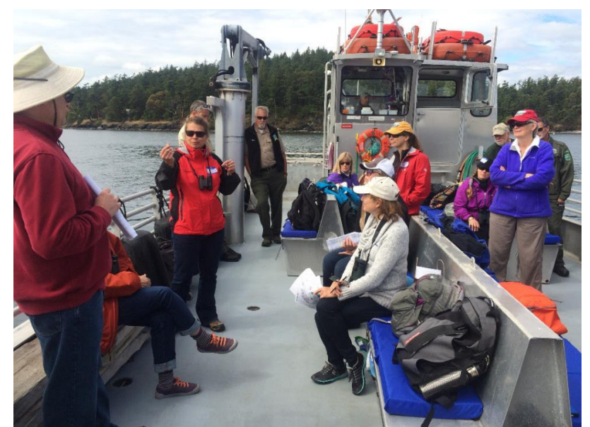
Cooperating Agencies, MAC Members, and Others Tackle Human Use and Socioeconomic Analysis

The Cooperating Agency representatives have thoroughly reviewed all of the resource alternatives and suggested edits to most, in both their abbreviated and more descriptive forms. In order to ensure that every reasonable scenario was considered, the BLM hosted a "floating planning tour" with Cooperating Agency representatives, MAC members, and other local land management organizations. With a resource listing for approximately 24 rocks and islands, and a map of the puzzle pieces of all