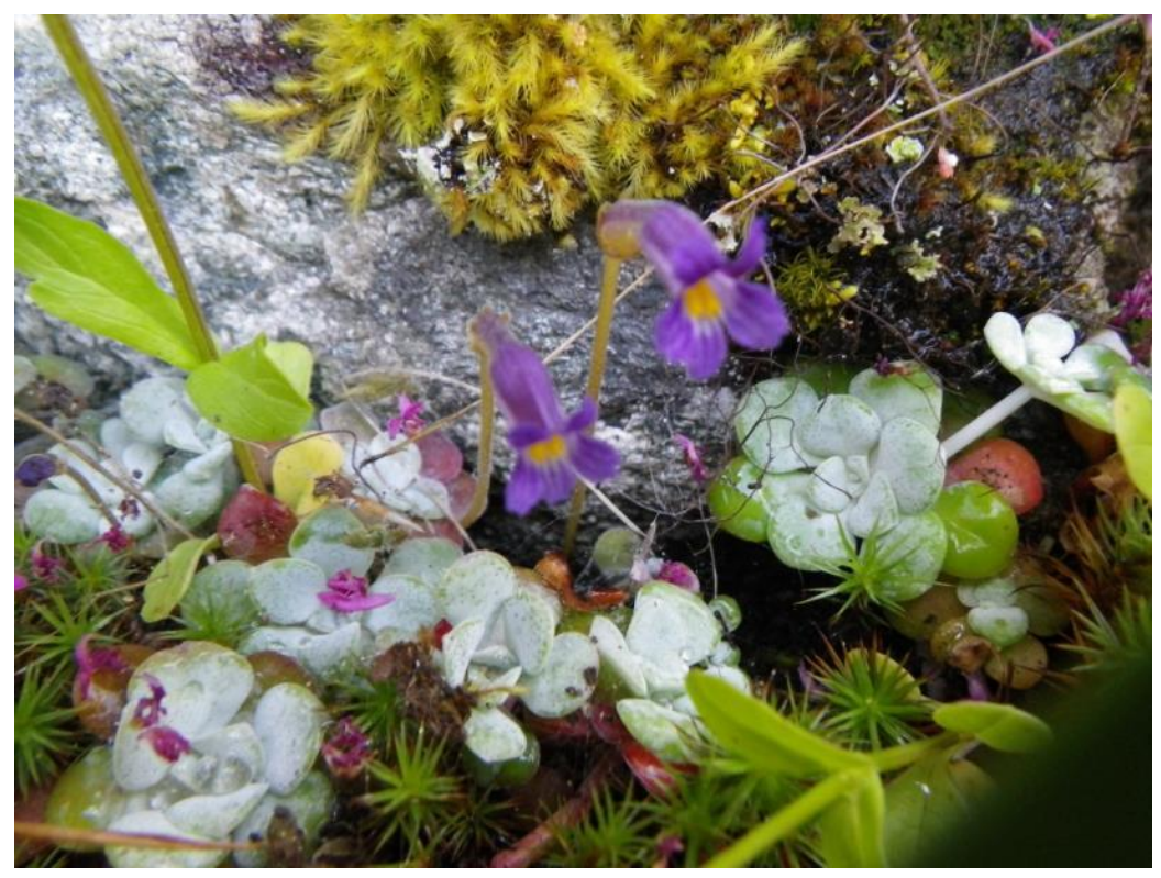
Skull Island Spring Bloom

The Terrestrial Managers Group (TMG), with a steering committee of BLM, San Juan Island National Historical Park (NPS), San Juan Islands National Wildlife Refuge (USFWS), San Juan County Parks and Recreation, Washington State Parks (State Parks), the San Juan County Land Bank (Land Bank), the San Juan Preservation Trust (Preservation Trust), and the San Juan County Conservation District (Conservation District) has continued to grow in capacity to address conservation in the islands at a large landscape level. Though they have no office in the islands, Washington State Department of Natural Resources (DNR) does have several key inholdings, so has joined the steering committee. NPS gained a new superintendent who made a quick study of the purpose and direction of the TMG and is already playing a major contributing role. Washington State Department of Fish and Wildlife has been a participant with a primary focus on the rare Island Marble Butterfly. This year, planning for this species of butterfly expanded from NPS American Camp, where it was rediscovered after nearly 100 years without any sightings, to include all land managers within its potential habitat along the south end of San Juan Island: USCG, DNR, and BLM. Prior to completion of our land use plan, the BLM is playing a role in public outreach and environmental education, which are certainly factors in any species survival plan.