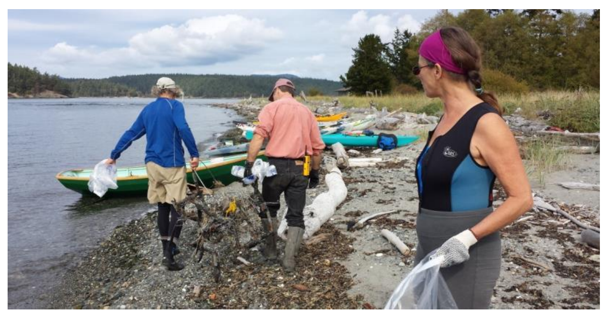
Kayak Beach Cleanup, NPLD

Until the agency has established a baseline for the balance of our landscapes for these resources, identified stressors are conjecture. Much of the natural habitat is intact and, apart from the primary tourism spots, the balance of wildlife populations seems unaffected. Again, the increased potential of an oil spill in the Salish Sea presents an increased risk of grave impacts to species that are dependent on the marine environment. Vulnerable aspects of this environment would include rocks for resting, roosting and nesting, bays and protected areas that serve as salmon nurseries, and marine life forms that are food sources. The Iceberg Monitors have indicated a perceived lessening of birds on the south end of Lopez Island, with increased noise levels from Navy overflights being a major environmental change over the last few years.