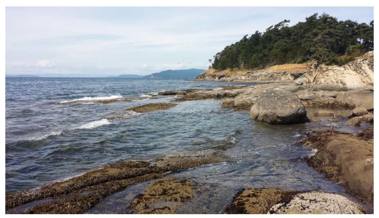
Lee Side of Patos Island

The islands have a large population of retired professors and scientists, many of whom are recruited to our volunteer monitoring teams. Naturalists with other kinds of academic backgrounds also spend a great deal of energy researching ecosystem activities, as do youth programs, summer camps, and school groups. The Islands have a strong, protective constituency that monitors activities to ensure that there is no unauthorized collecting nor unsafe or resource damaging actions.