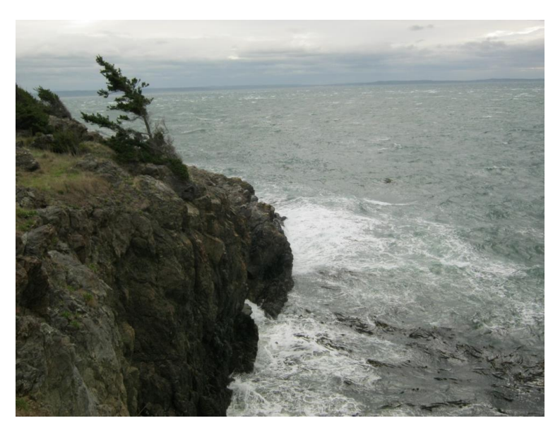
Storms on Kellet Bluff

There are few stressors other than being over-loved, which is distressing to local communities. However, education initiatives, landscape recovery efforts, and sustainable tourism discussions and workshops have eased the concerns. Overall, there is a high degree of naturalness for much of these landscapes. Coastal bluffs and shorelines are eroding due to seasonal storms. Invasive plants spread from cultivated areas and developments, but these activities are primarily limited to high-traffic areas. The nonnative mustards attributed with the recovery of the Island Marble Butterfly were prolific this year.