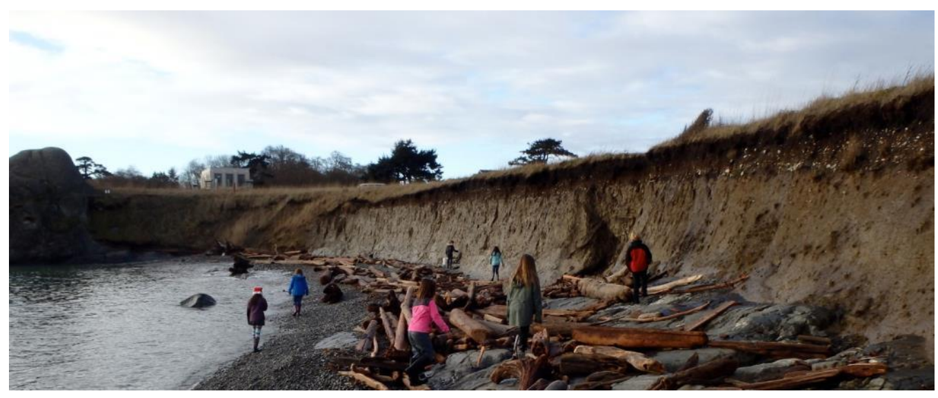
Midden washing out of Feeder Bluffs, San Juan Island