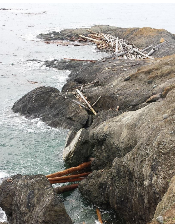
Cliffs at Iceberg Point, Lopez Island

The TMG Annual Meeting in March had 73 attendees and was organized around the principles of Leave No Trace (LNT), the main conservation initiative for the county, driven by the TMG. The San Juan County Land Bank, an adjacent landowner in many locations, featured collaborative mapping for conservation and public access. They also hosted a tour of their Salish Seeds farm, the growth site for starts of local genetic stock, much of which continues to depend on our Seeds of Success program. Acquisition as a means of protection was featured and explained through the perspective of the individual land management agency missions and planning. Attendees were introduced to the cooperative effort among the organizations to address ecologically or culturally significant lands that may become available to purchase.