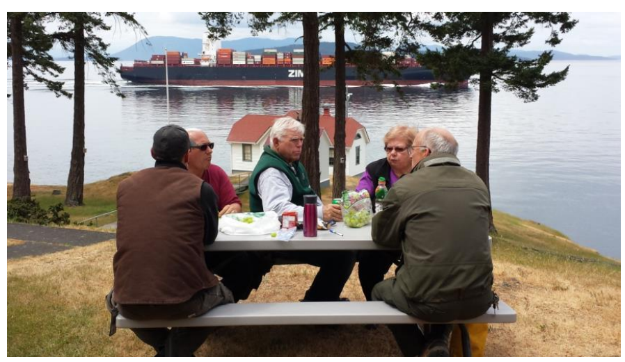
Container Ship Navigating the Turn Point in Haro Strait