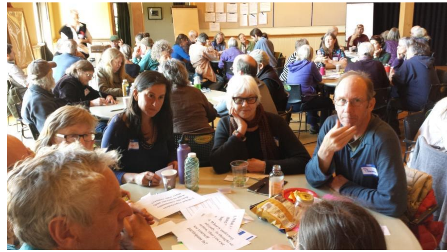
Lopez Island Community ponders Sustainable Tourism

OR/WA NLCS State Strategy, Goal 2D: Adopt a community-based approach to recreation and visitor services delivery consistent with the conservation purpose of the NLCS and the socio-economic goals of the local community.