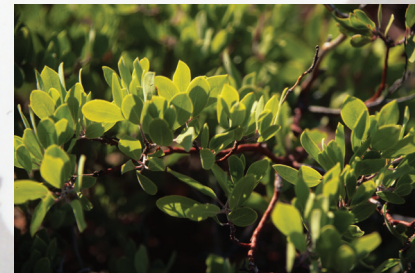
Manzanita—used for medicinal purposes by Native Americans.

In the midst of the formations, clinging to the cracks and crevices high on the cliff face, the vibrant green leaves and red bark of the manzanita shrub stand in sharp contrast to the muted colors of the rocks. A hardy evergreen, the manzanita produces a pinkish-white flower in the spring that adds to the plant’s luster. Other desert plants found in the area include Indian paintbrush, Apache plume, rabbitbrush, and desert marigold.