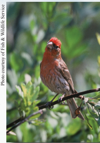
The House Finch is commonly seen at the monument—the male has a bright red chest while the female is brown with bold streaks.

The National Recreational Trail is for foot travel only, and contains two segments that provide opportunities for bird-watching, geologic observation and plant identification. Both segments of the trail begin at the designated monument parking area. The Cave Loop Trail is 1.2 miles long, rated as easy and portions are ADA accessible. The more difficult Canyon Trail is a 1.5-mile trek up a narrow canyon with a steep (630-ft) climb to the mesa top for excellent views of the Sangre de Cristo, Jemez, Sandia mountains and the Rio Grande Valley. Both trails are maintained; however, during inclement weather the canyon may flash flood and lightning may strike the ridges.