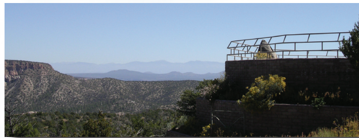
From the Veterans' Memorial Scenic Overlook, you can see spectacular vistas of Camada and Peralta Canyons, the Dome Wilderness, and Jemez Mountains.

An ATM machine, refreshments and gas, can be obtained at the convenience store located near the town of Cochiti Lake. Camping, boating facilities and RV hookups are accessible at the Cochiti Lake Recreation Area.