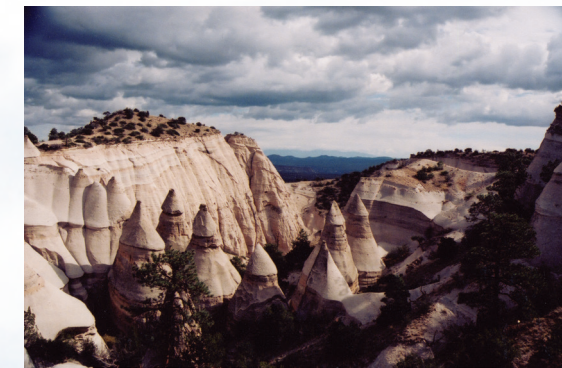
A beautiful view of the tent formations from atop the Canyon Trail.