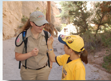
The monument serves as an outdoor laboratory for students of all ages.

As the result of uniform layering of volcanic material, bands of grey are interspersed with beige and pink-colored rock along the