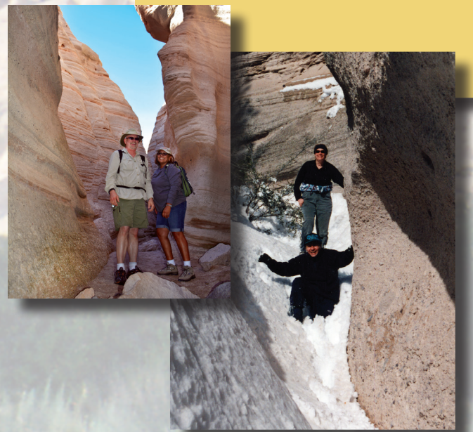
Hikers enjoy all seasons at the monument.