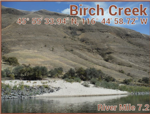
Birch Creek 45° 55' 33.94" N, 116° 44' 58.72" W