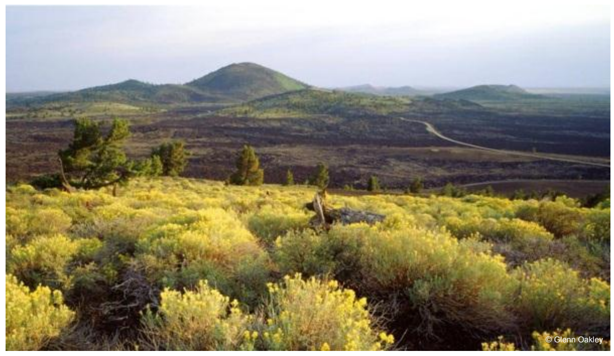
Craters of the Moon National Monument and Preserve

The national NLCS program released the "National Landscape Conservation System 15-Year Strategy" in 2011. The strategy focused on four themes, each with multiple goals, objectives, and actions. One of the actions was for each state to develop their own NLCS strategy. This Idaho-specific strategy is consistent with the national strategy and focuses on the same four themes. Idaho's strategy is intended to provide direction for the NLCS program for the next three to five years.