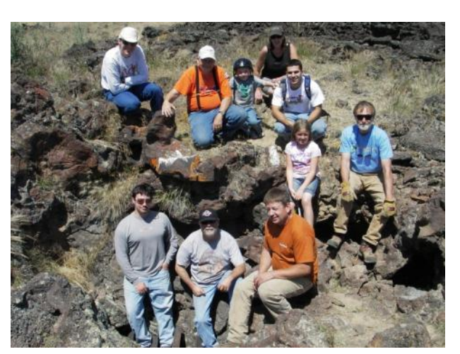
Gem State Grotto volunteers at Craters of the Moon NM

1. BLM Idaho will continue to actively participate in the Idaho Recreation and Tourism Initiative (IRTI). The IRTI is a coalition of state and federal agencies and others dedicated to providing Idaho citizens and visitors with expanded recreation opportunities. The primary objective is to improve public information and services associated with recreation and tourism opportunities in Idaho through partnerships and cooperation.