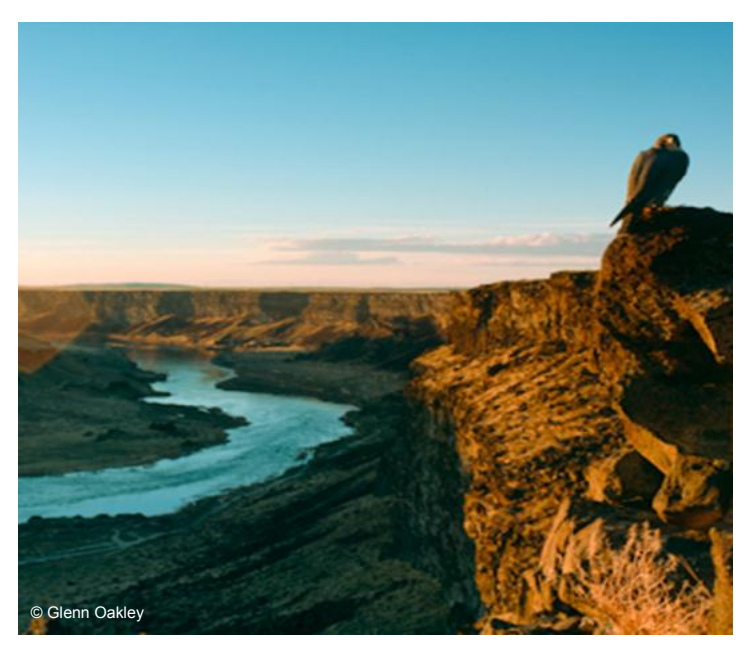
Morley Nelson Snake River Birds of Prey National Conservation Area

The NLCS offers some of the most remarkable and expansive landscapes found on public lands in the American West. To be a component of the NLCS, a unit must have been designated for protective and conservation purposes by the Congress or President. The System focuses on