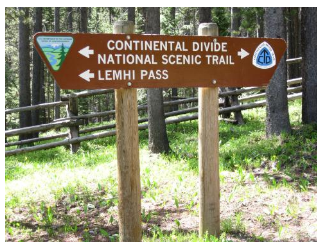
Continental Divide National Scenic Trail and Lemhi Pass

2. BLM can serve as an information resource for grassroots efforts interested in exploring possible designations through legislation pertaining to the NLCS and will encourage proposal supporters to include and work with diverse interest groups.