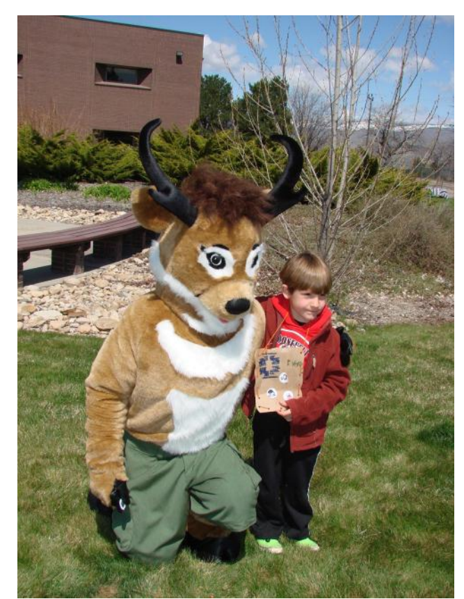
BLM mascot Seymour Antelope raises public awareness of the importance of connecting children with nature