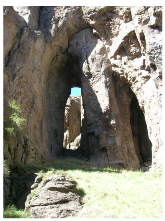
Cave Draw, Bruneau-Jarbidge Rivers Wilderness

1. Inventory brochures, publications, and other outreach tools to determine what is currently available to the public about the NLCS. Identify and develop other needed outreach tools including but not limited to site-specific brochures, maps, websites, social media, and podcasts. Emphasize connections among local NLCS areas to the overall NLCS and the BLM system of public lands.