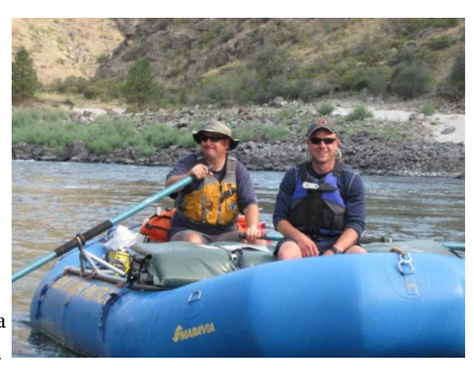
Lower Salmon Suitable River near Snow Hole WSA

5. Work with tribes, partners and communities to understand the effects of NLCS management and planning on adjacent lands, including social, economic, and ecological impacts. Participate in local planning and watershed analyses efforts to identify the effects of adjacent land management on NLCS areas.