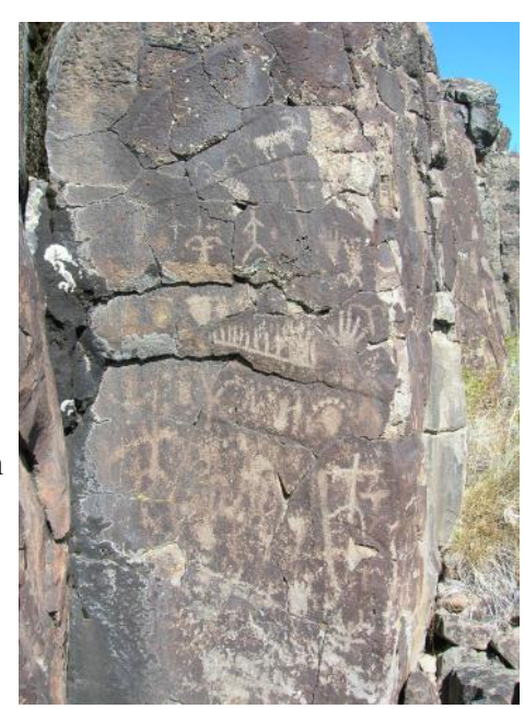
Petroglyphs in the Wilderness

f. All NMs and NCAs will maintain an inventory of NLCS objects and values identified in their enabling legislation or proclamations, and from post-designation inventories and subsequent monitoring. Such values will receive priority for conservation, protection, and restoration in land use plans and subsequent implementation-level plans and projects.