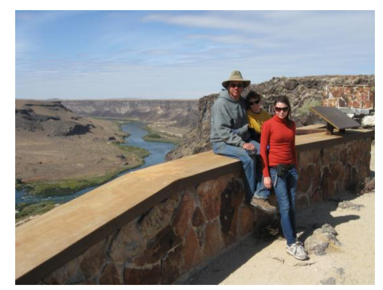
Dedication Point overlook Birds of Prey NCA