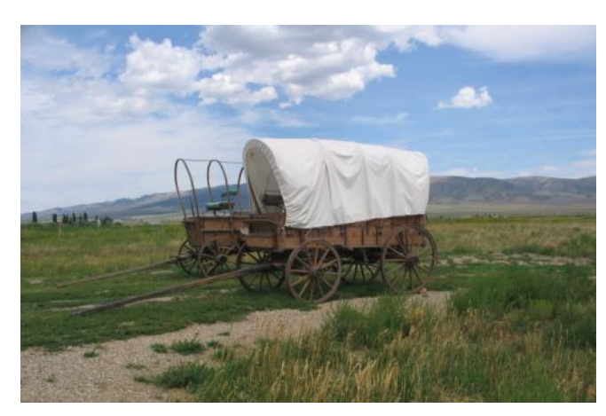
Oregon National Historic Trail wagon replica

as the primary objective within these areas. In this theme, we focus on ensuring that BLM management of NLCS lands is guided by the purposes for which the lands were designated and on using science to further conservation, protection, and restoration of these landscapes, while providing opportunities for compatible public use and enjoyment.