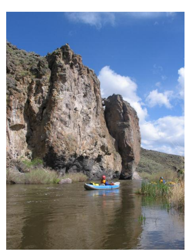
South Fork Owyhee Wild & Scenic River

Develop measures and conduct periodic management reviews to assess management effectiveness of