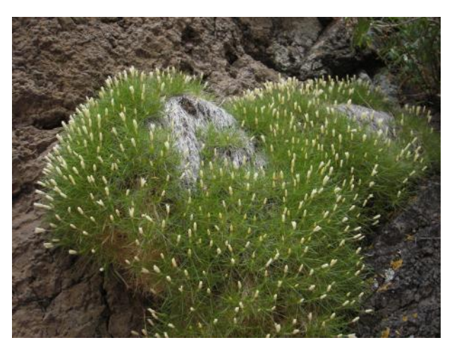
Bruneau River Phlox Bruneau WSR

Recognizing that the NLCS represents a small portion of the land managed by the BLM and other federal, state, tribal, and local government entities. These special conservation areas must be managed within the context of the larger landscape. By establishing connections across boundaries with other jurisdictions, management of NLCS areas will complement conservation areas within the respective jurisdictions of the National Park