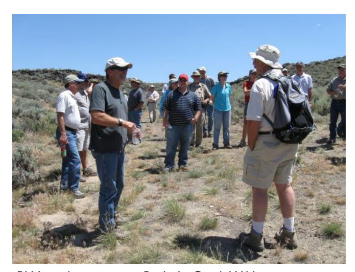
BLM employees visiting Big Jacks Creek Wilderness

Moon NM and Preserve develop education and interpretive plans.