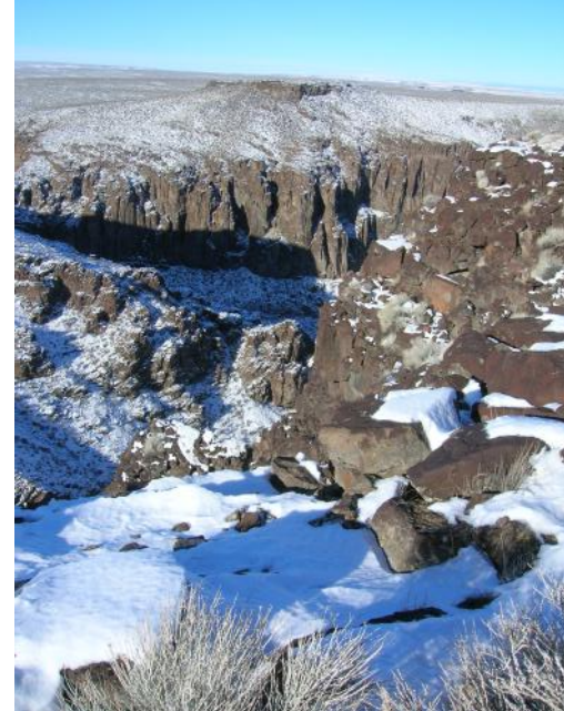
Big Jacks Creek Wilderness