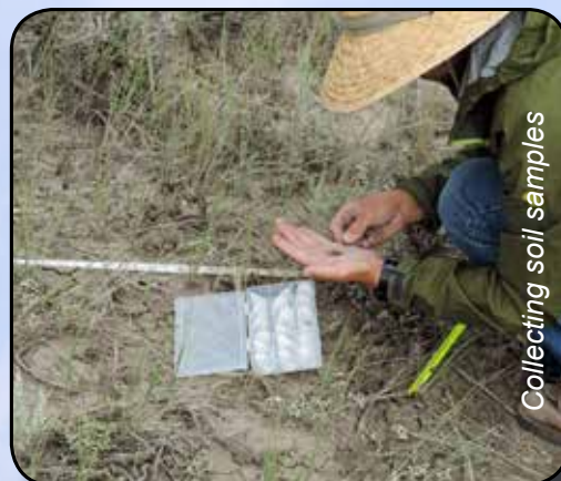
Collecting soil samples