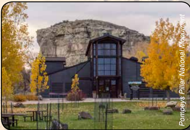
Pompeys Pillar National Monument