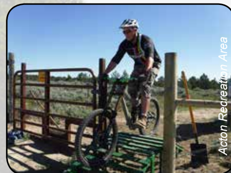
Acton Recreation Area