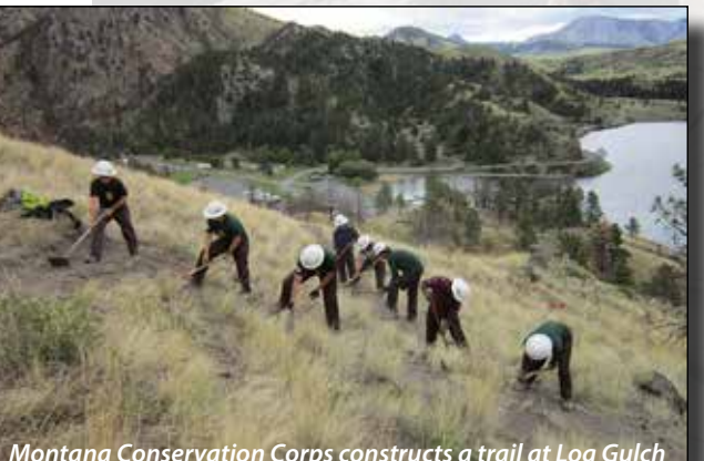
Montana Conservation Corps constructs a trail at Log Gulch

The BLM recently joined the Public Lands Foundation in awarding the Montana Conservation Corps the Landscape Stewardship Certificate of Appreciation in recognition of its outstanding contributions to public lands. The BLM/MCC partnership enables the BLM to focus on several key goals involving youth, leadership, and public land stewardship. In the last three years, nearly 500 youth have served more than 15,000 hours on projects such as planting trees and shrubs; treating noxious weeds; restoring sagebrush, grassland and riparian environments; constructing and maintaining trails; removing old fences and building new ones; installing signs; and inventorying and stabilizing cultural resources.