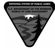
EXHIBIT A CORRECTED

Shotgun Formation Timber Sale Contract No. ORN05-TS-2025.0565 T. 15 S., R. 02 W., Sec. 13 Will. Mer., Northwest Oregon District