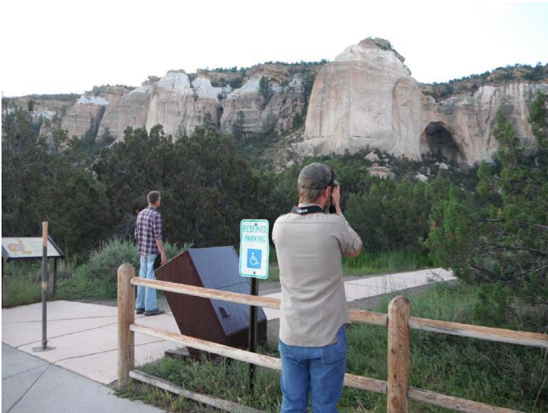
Visitors Enjoying El Malpaís National Conservation Area

In Fiscal Year 2024, El Malpaís' Ranger Station was open five days per week (Thursday through Monday). It received steady visitation throughout the year, though there was a decline in numbers during the time the Ranger Station lacked running water. The Ranger Station received 2,809 visitors, and overall, the NCA received a total of 113,587 visitors during the fiscal year. Historically, visitor use numbers have been gathered using a variety of methods. These methods include collecting data from nearby National Park Service's (NPS) El Malpaís National Monument's Visitor Center and the NCA's special recreation permits. Recreation staff also deployed new TRAFx vehicle counters in Fiscal Year 2021, with additional installations in Fiscal Year 2022. In the Recreation Management Information System (RMIS), past estimates of annual visitation were less accurate compared to the data now provided by TRAFx counters. BLM anticipates visitation will continue to grow due to El Malpaís' rising popularity and the overall increasing interest in outdoor activities.