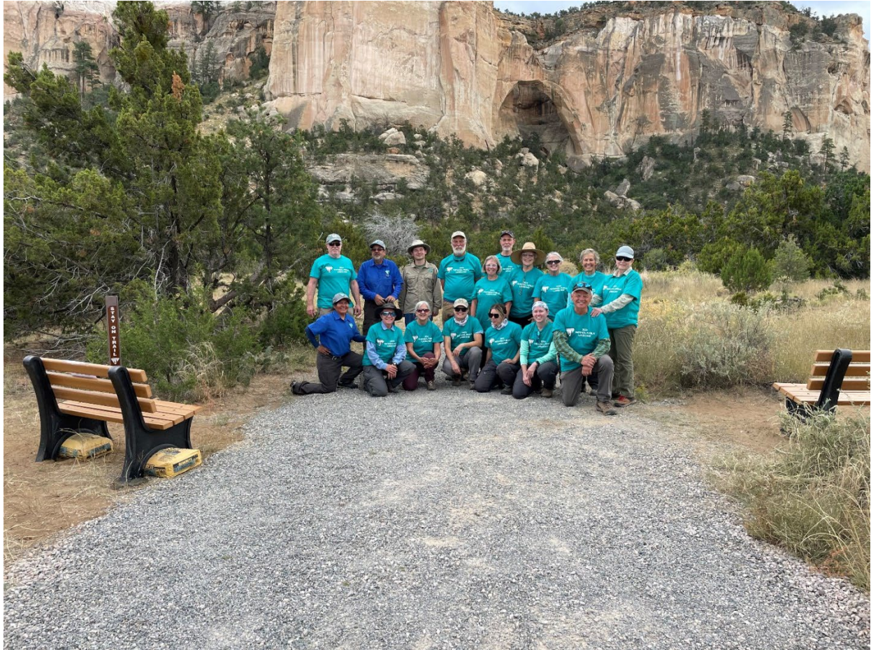
Volunteers on National Public Lands Day.

In September 2024, the National Public Lands Day event at La Ventana Arch in El Malpaís NCA had a great turnout. A dedicated group of 16 volunteers came together to help install two benches at the iconic arch.