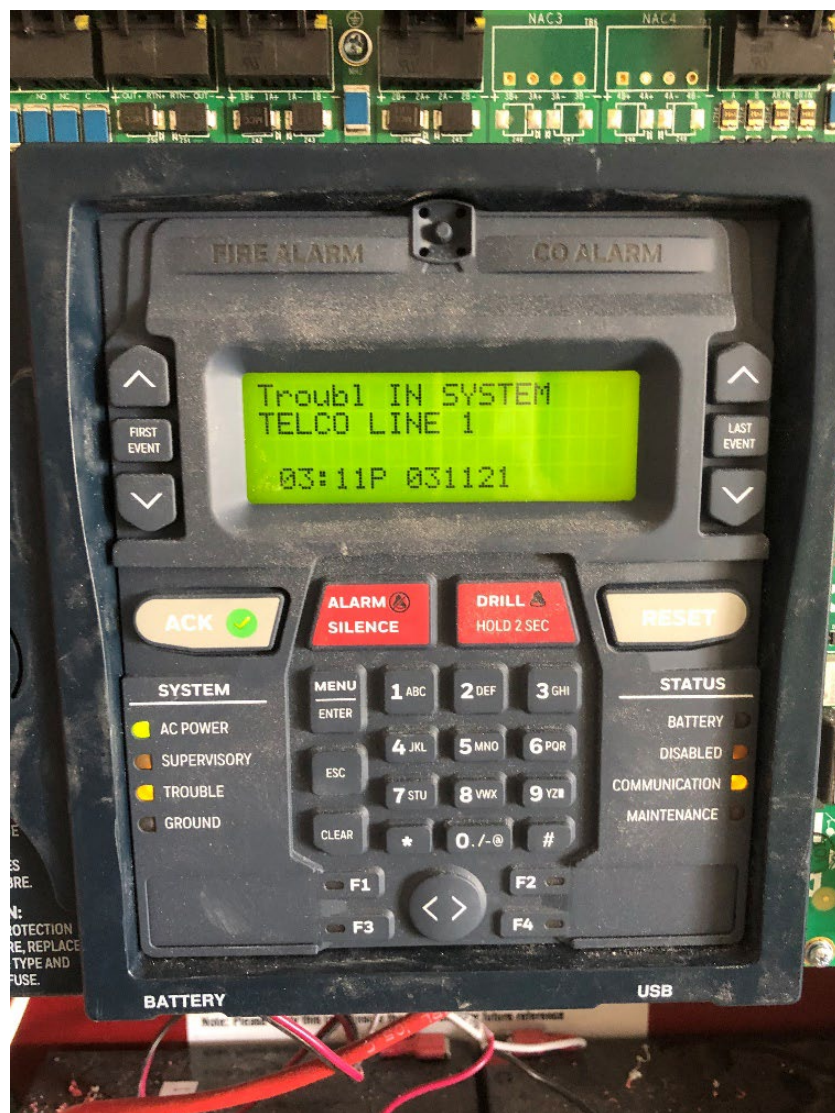
Failed safety alarm panel.

In Fiscal Year 2024, the most significant challenges at the NCA primarily centered around the Ranger Station. In June 2024, the pump that supplies water to the Ranger Station failed due to corroded electrical lines. And in July of 2024, the security and fire alarm system at the Ranger Station also malfunctioned. Both technical challenges persisted past the end of fiscal year 2024 but were resolved before the end of calendar year. During the water outage at the Ranger Station, visitors had access to a portable toilet with a handwashing station in the parking lot. Meanwhile the rangers conducted daily fire safety checks until the fire and security alarm systems were restored.