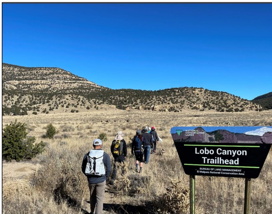
Hikers visiting the NCA.

One of the unique resources in the NCA that requires strong partnerships is the management of the CDT. The CDT traverses through the NCA and the National Monument for more than 40 miles. This NCA section of the trail is approximately 20 miles and winds through the Chain of Craters in an environment of piñon, juniper, ponderosa pine, shrubs and grasses. However, a large majority of visitors bypass this section by using Hwy 117 as a more direct route to hike north into Grants. For the past several years, the State Office and Rio Puerco FO have worked on a land exchange with the Acoma Pueblo to facilitate a more direct route for CDT hikers near Grants. This exchange is in line with the CDT's mission to keep hiker routes off highways. The BLM, the CDT Administrator, Continental Divide Trail Coalition, NPS, State of New Mexico, and US Forest Service are coordinating routes, improvements, easements, and acquisitions in the area and throughout the state of New Mexico.