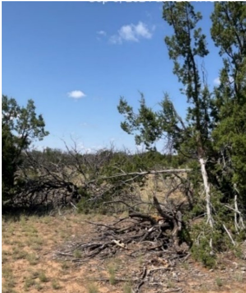
Area affected by payload landing.

Thankfully, there was no significant damage to any resources, and BLM staff were able to be adaptive and quickly respond to support NASA in managing the incident.