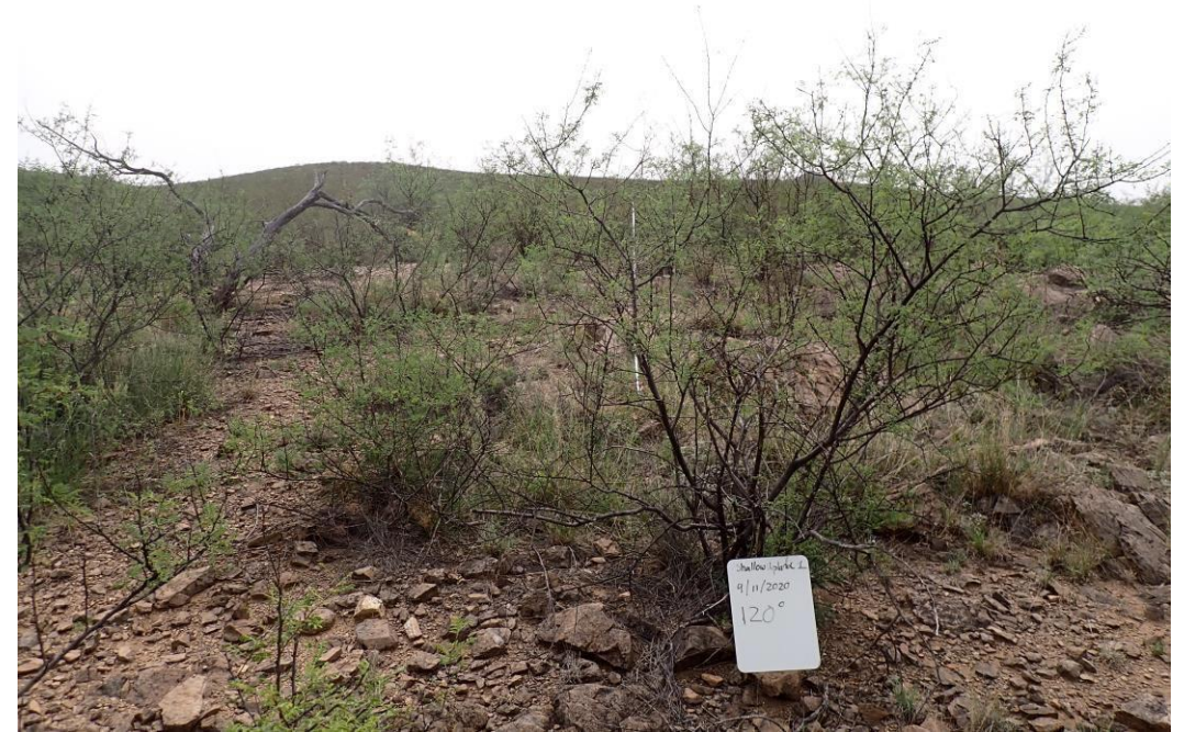
Shallow Upland 1 9/11/2020

Green = meeting allotment adaptive management objective, Red = not meeting allotment adaptive management objective, and Orange = not meeting allotment desired plant community objective.