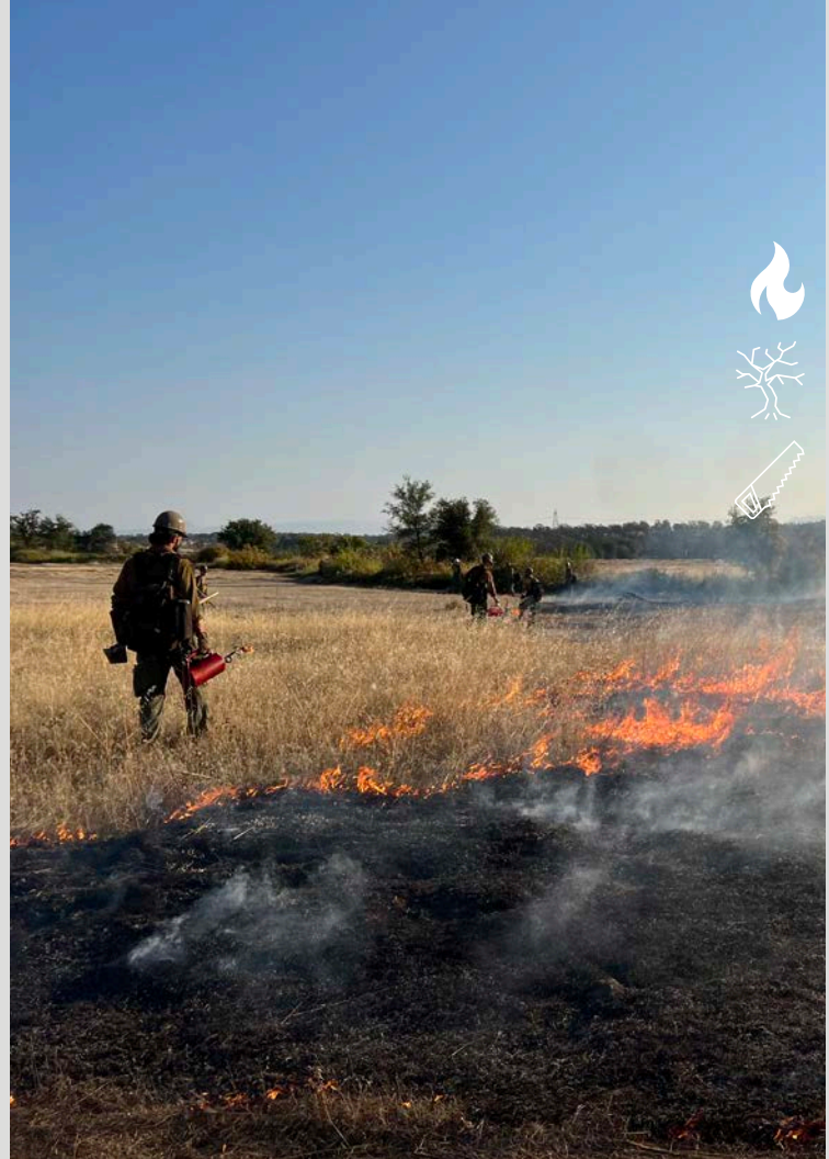
Prescribed fire near Sacramento River Bend Area