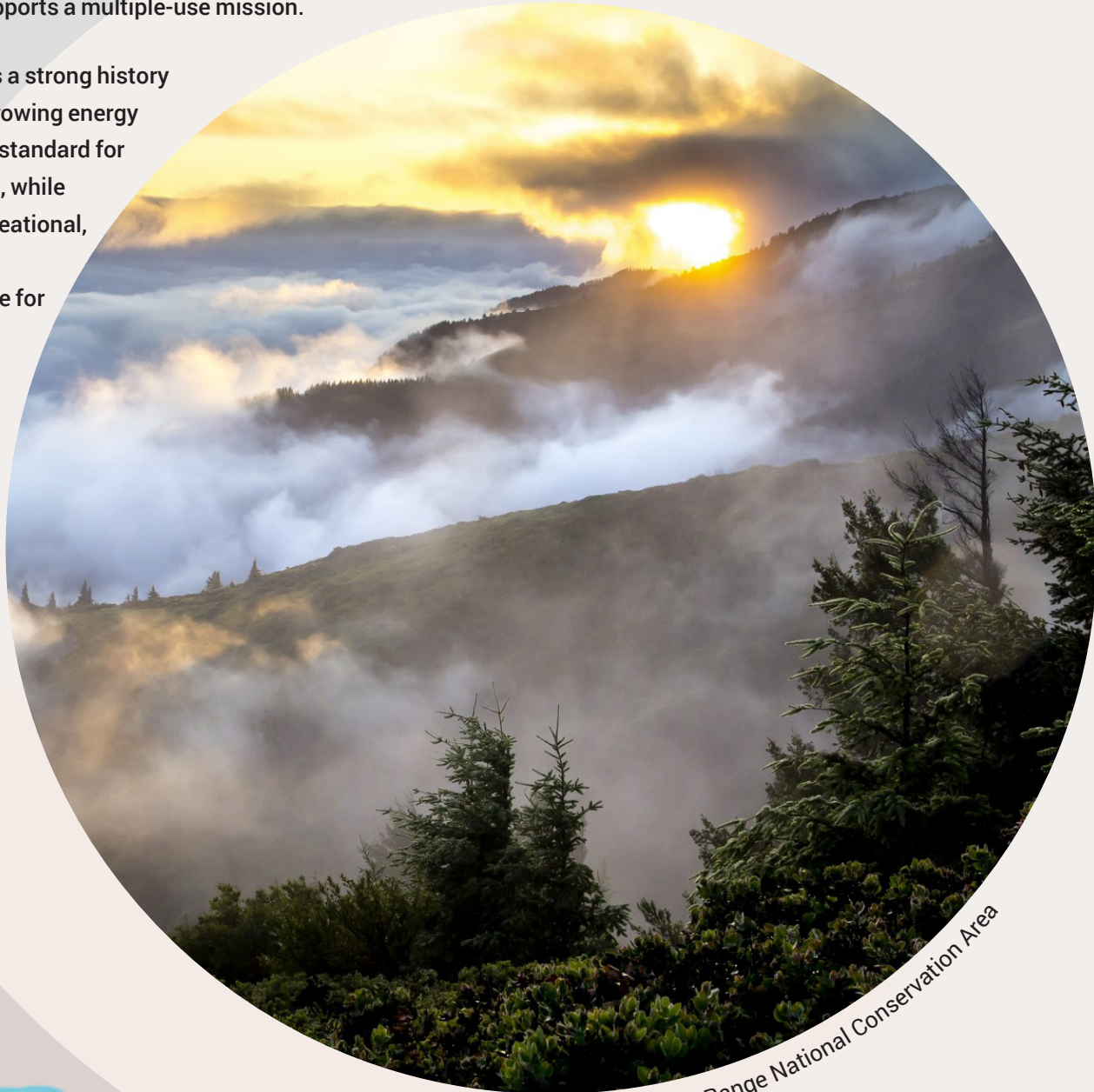
King Range National Conservation Area