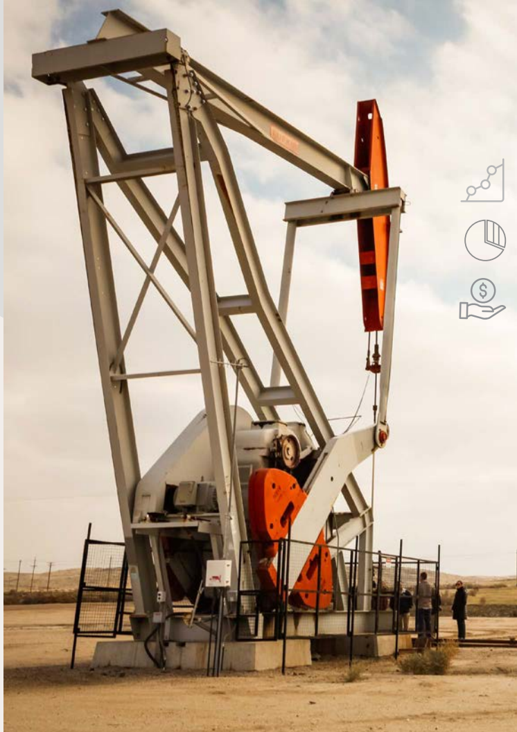
Bakersfield Field Office Oil Derrick