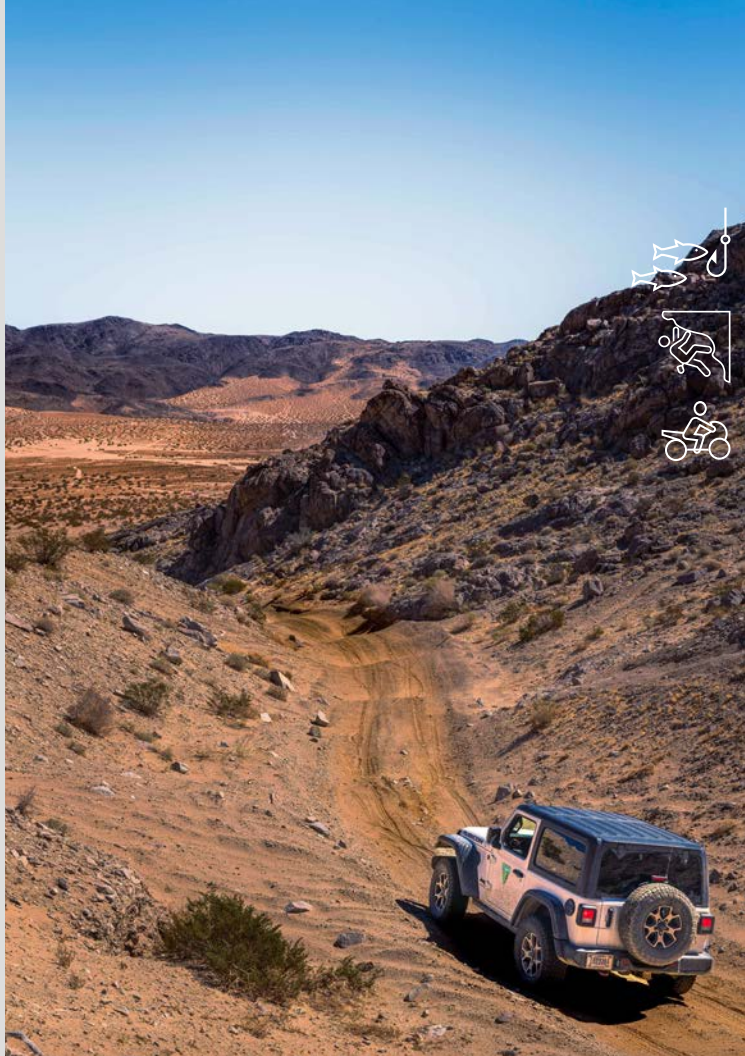
Johnson Valley OHV Area