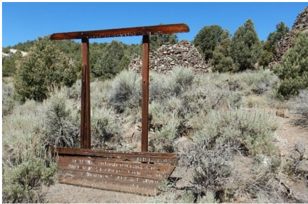
Sign In Need of Replacement in the BMDO.

Restoration and Reinforcement of the Historic Town of Rhyolite. $5,000.00.