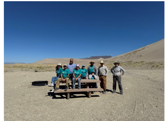
Crescent Sand Dunes New Table and Fire Rings.