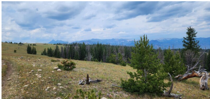
Washiske Needles, Absaroka Front

Award option year 2 for cleaning services contract. USFS climbing ranger monitoring. Annual building & site maintenance. Routine equipment purchases. Recreational Labor.