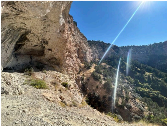
Popular climbing area known as the amphitheater