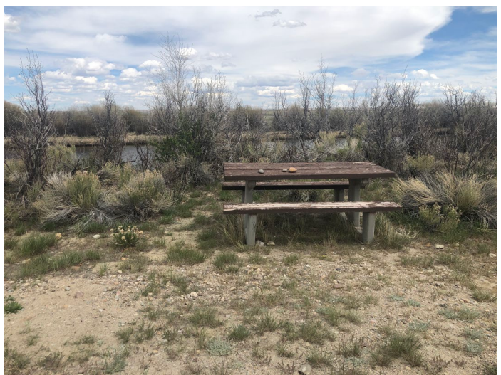
Repair and/or replacement of picnic tables

Replacement of signage along access routes and within Recreation Areas \sim $1,000