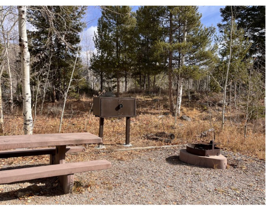
Campsite with Bear Resistant Food Storage Box