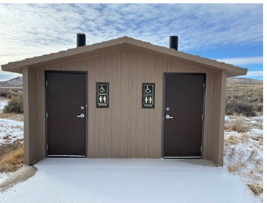
Doors replaced after vandalism damage.