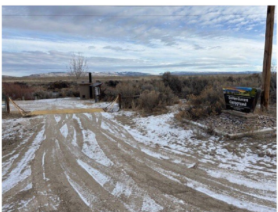
Entrance to Golden Currant Campground.