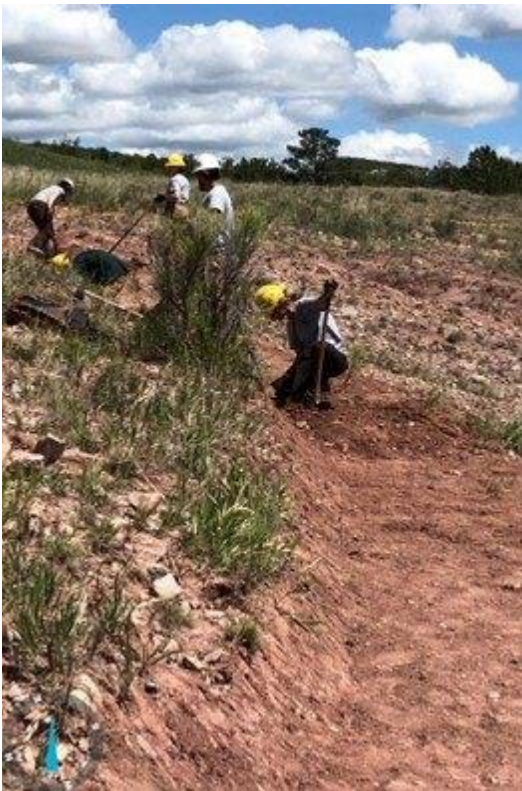
Planned trail work at Old Quarry Trails