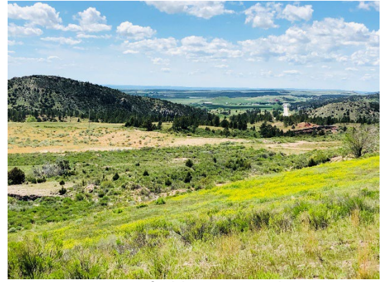
View of Old Quarry Trails.