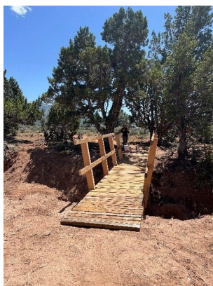
Pedestrian bridge in the Iron Hills Trail System