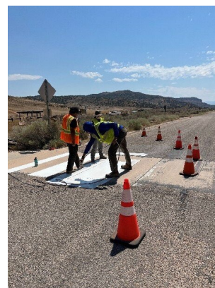
BLM staff paints crosswalk at Parowan Gap