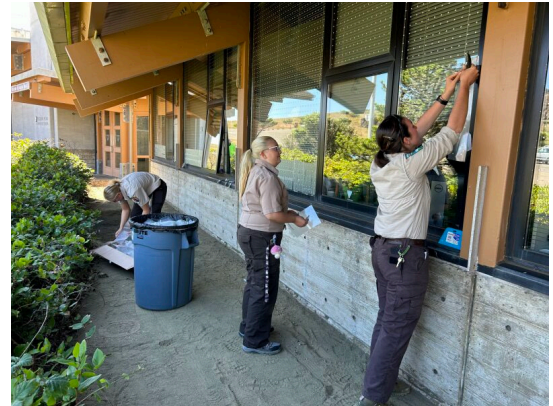
Interns treat facility windows with bird dots