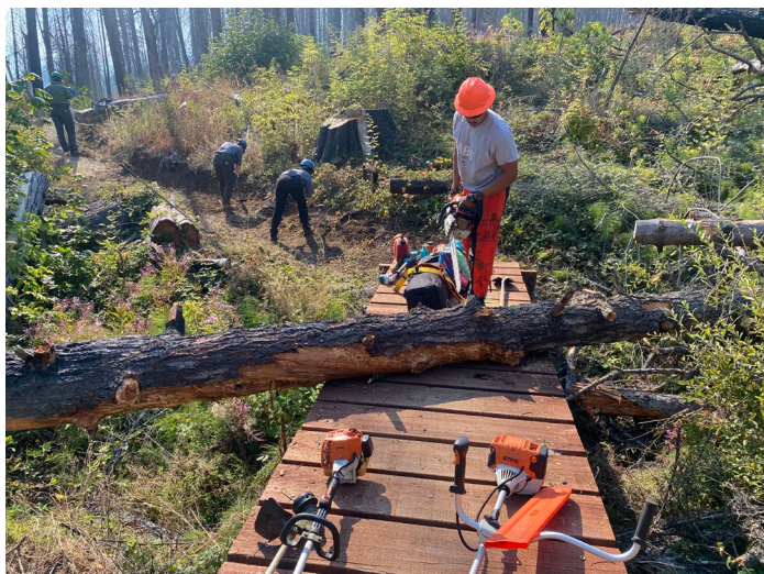
Ongoing hazard tree removal to protect investments

Lone Pine Campground Restoration: Total $250,000.00 with $100,000.00 from fee dollars.