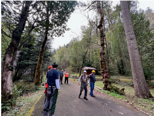
Hazard Tree Removal at Eagleview Campground