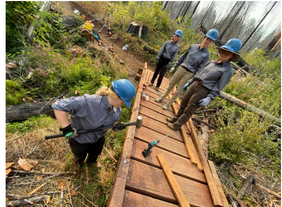
Boardwalk Construction Training with NYC