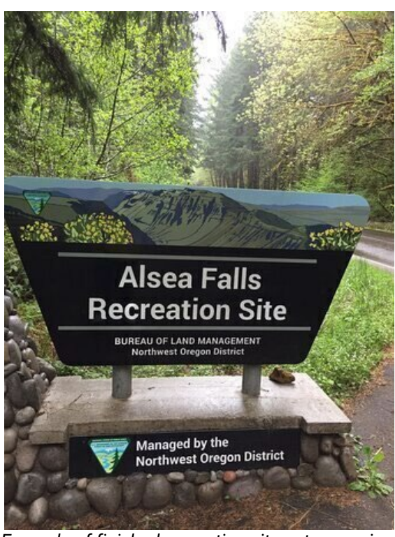
Example of finished recreation site entrance sign.

Continued post fire restoration of trails and recreation site infrastructure in Cascades Field Office. $20,000