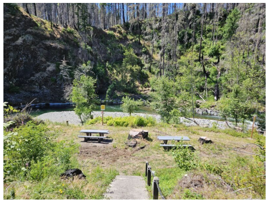
Canyon Creek Day Use Area-Summer 2024