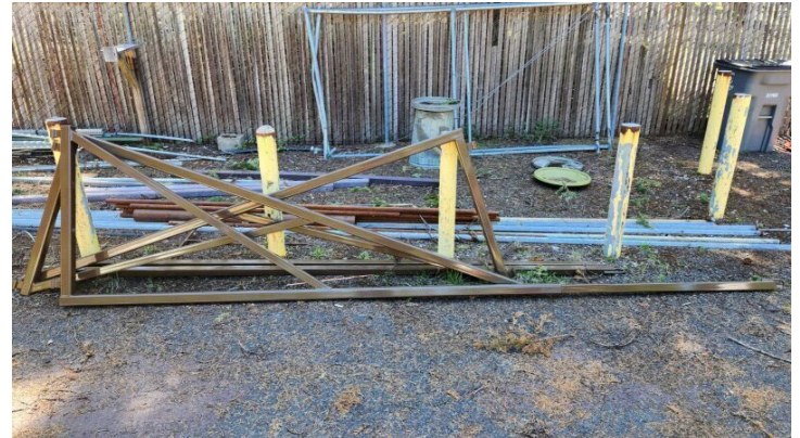
New Gates Ready for Installation