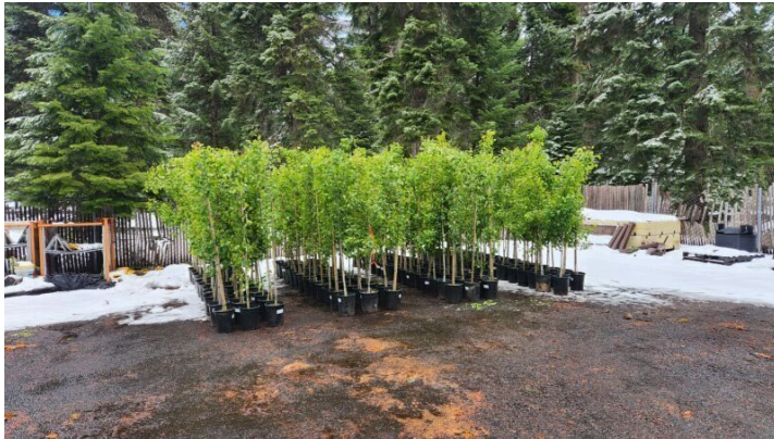
Aspen Trees Acclimating