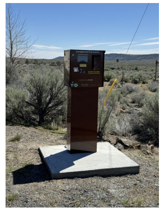
ROK (Remote Off-Grid Kiosk)