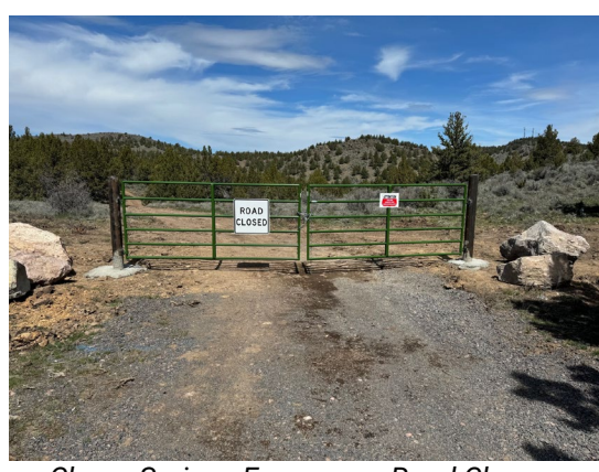
Cherry Springs Emergency Road Closure