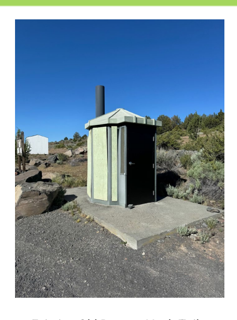
Existing Old Romtex Vault Toilet