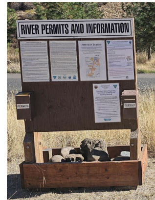
New River Kiosk at Stateline on Grande Ronde