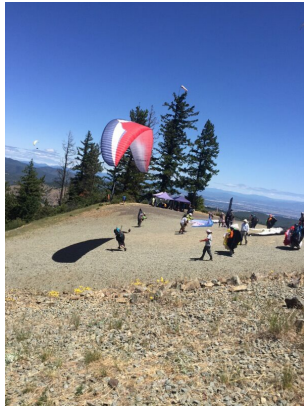
Woodrat Gliding Launch