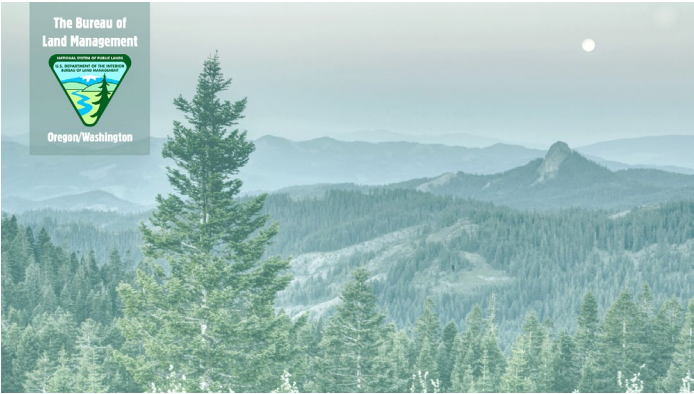
Ashland Field Office

Trailhead maintenance designated for use under SRPs in the Field Office