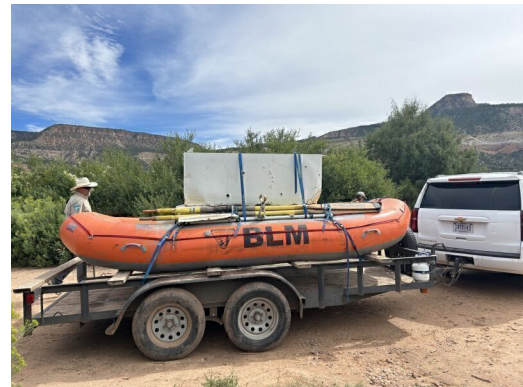
BLM Ranger Hauls Refrigerator Out of Chama River