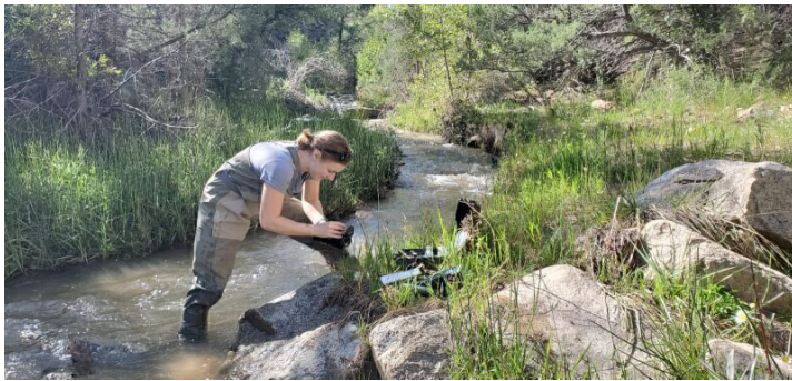
BLM Field Staff Conducts Water Quality Testing