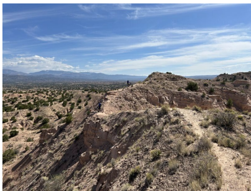
Bikers ride a trail in Nambe Badlands.