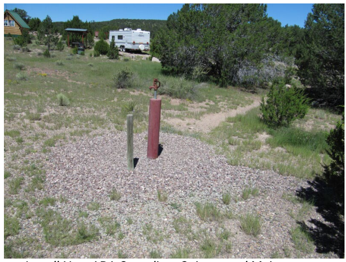
Install New ABA Compliant Spigots and Maintenance