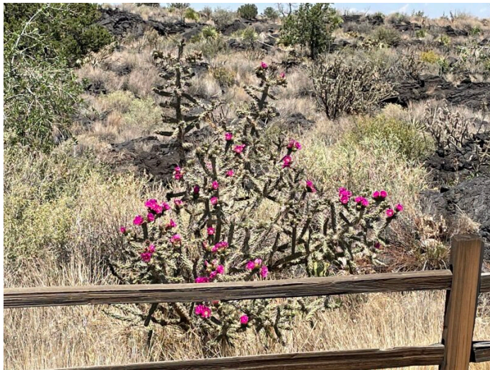
Cholla Cactus Blooming Near a Maintained Fence