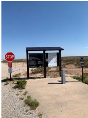
New Kiosk at OHV Area