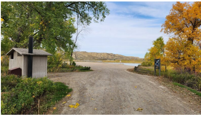
Wood Bottom Recreation Area

The planned activities for 2025 include the following: