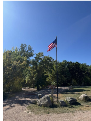
New flagpole at the BLM Alkali Creek Campground