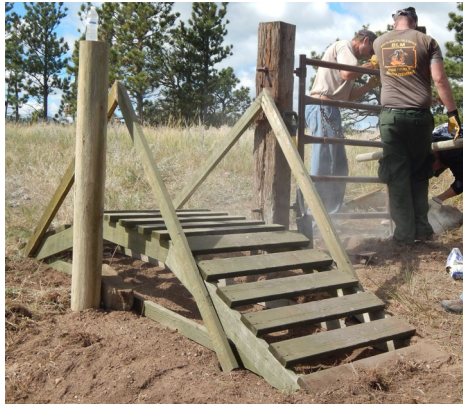
NPLD Workers Installing Biking/Hiking Rollovers