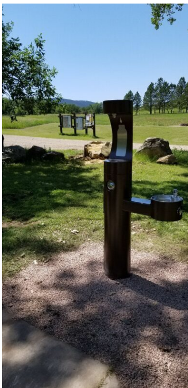
Improvements to the potable water system